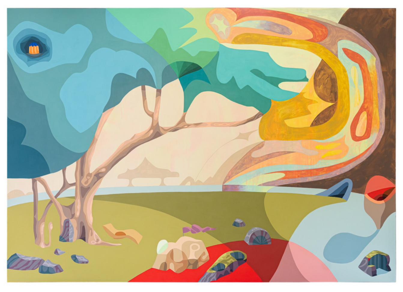
A bend towards something Acrylic on canvas, 152.4 x 213 cm, 2025