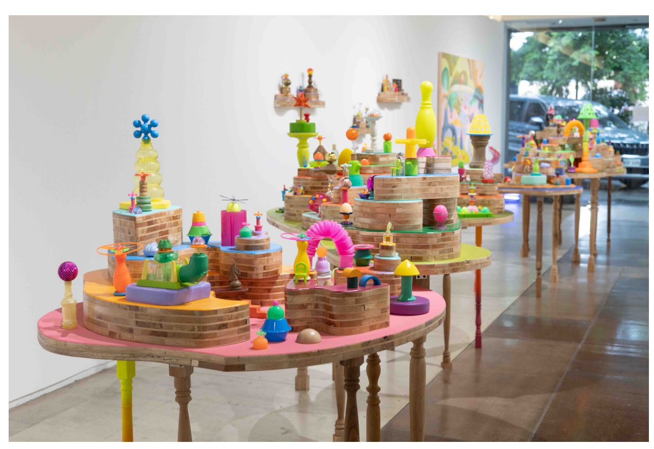
Elsewhere 1, 2 Found objects and acrylic on wood, 2025, installation view