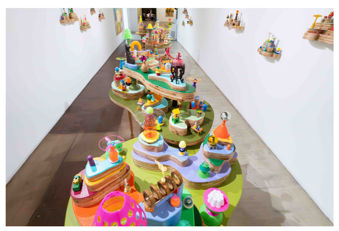
Elsewhere 6, 5, Promontory 8, 9, 10 Found objects and acrylic on wood, 2025, installation view