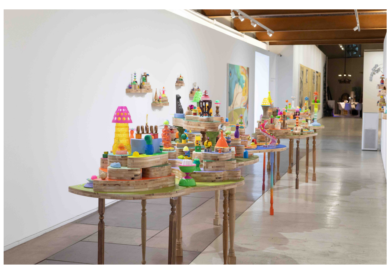
Elsewhere 6, 5 Found objects and acrylic on wood, 2025, installation view