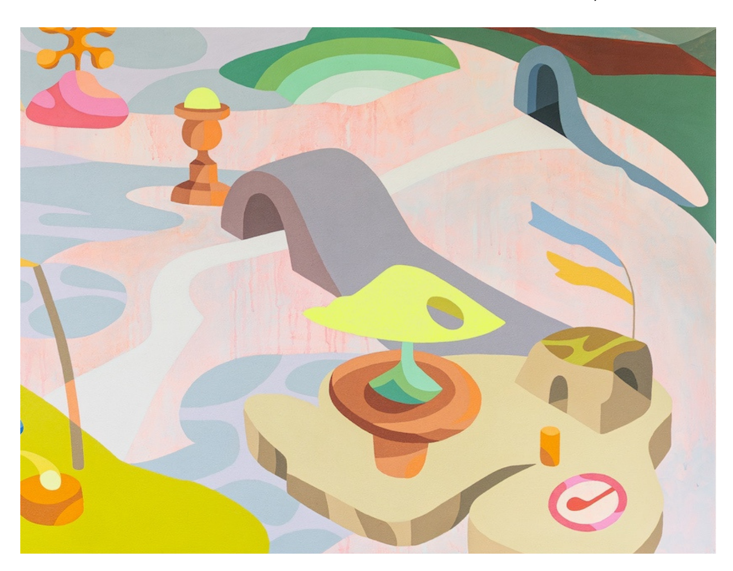
Text by Gwen Bautista

Overlooking, acrylic on canvas, 2025, detail