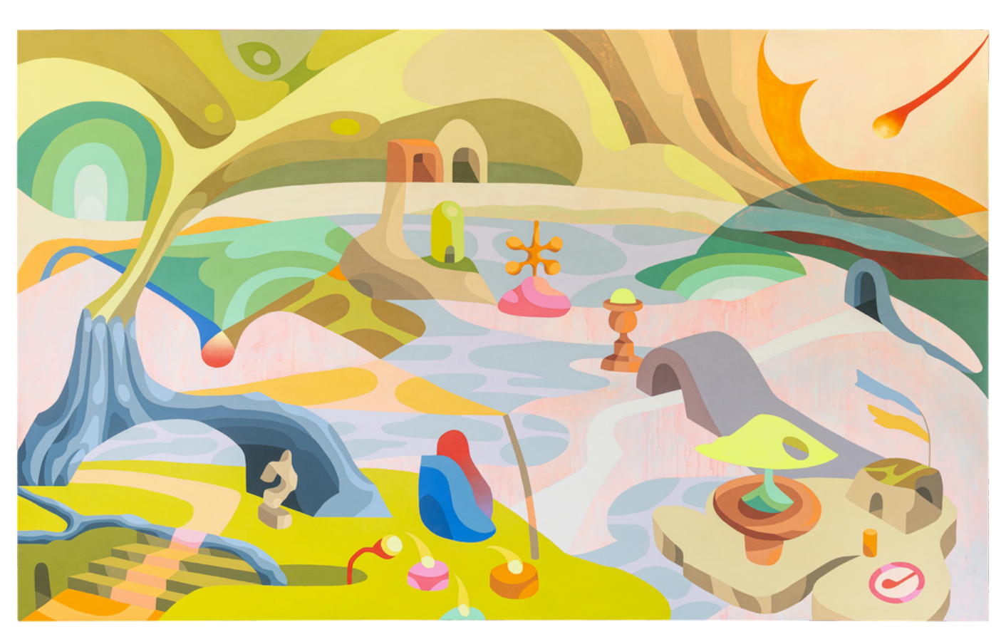
Overlooking Acrylic on canvas, 132 x 213 cm, 2025