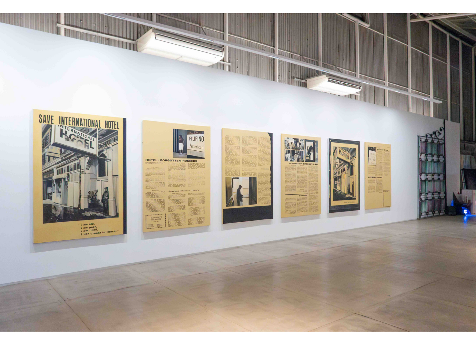
International Hotel Archives Oil on canvas, 2025, installation view