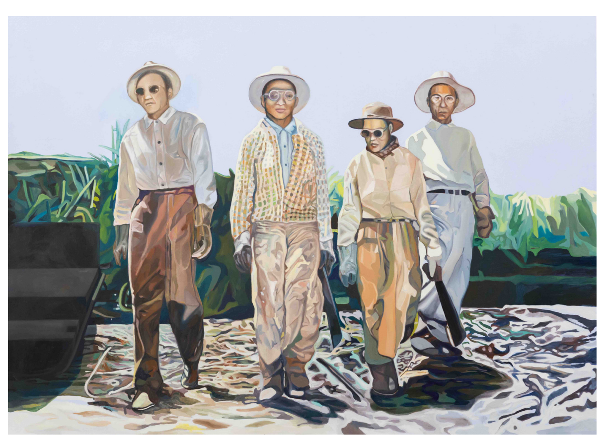
Manongs of Hawaii Oil on canvas, 140 x 196 cm, 2025