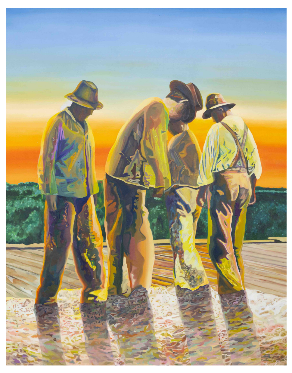
Manongs of Louisiana #2 Oil on canvas, 152.4 x 122 cm, 2025