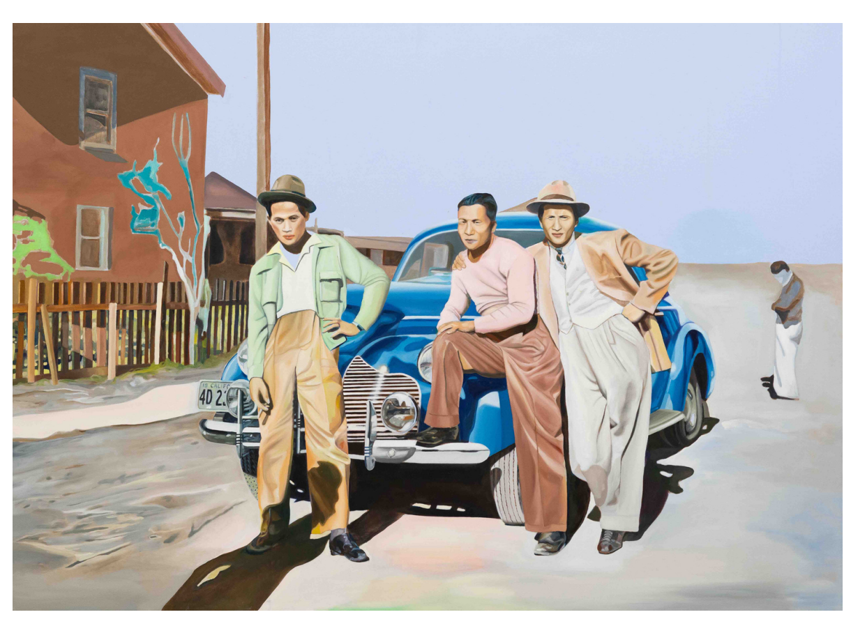
Manongs of Pajaro Vallery, California #2 Oil on canvas, 140 x 196 cm, 2025