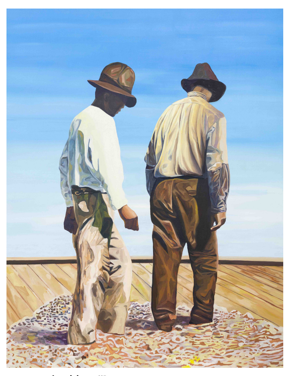
Manongs of Louisiana #1 Oil on canvas, 152.4 x 122 cm, 2025