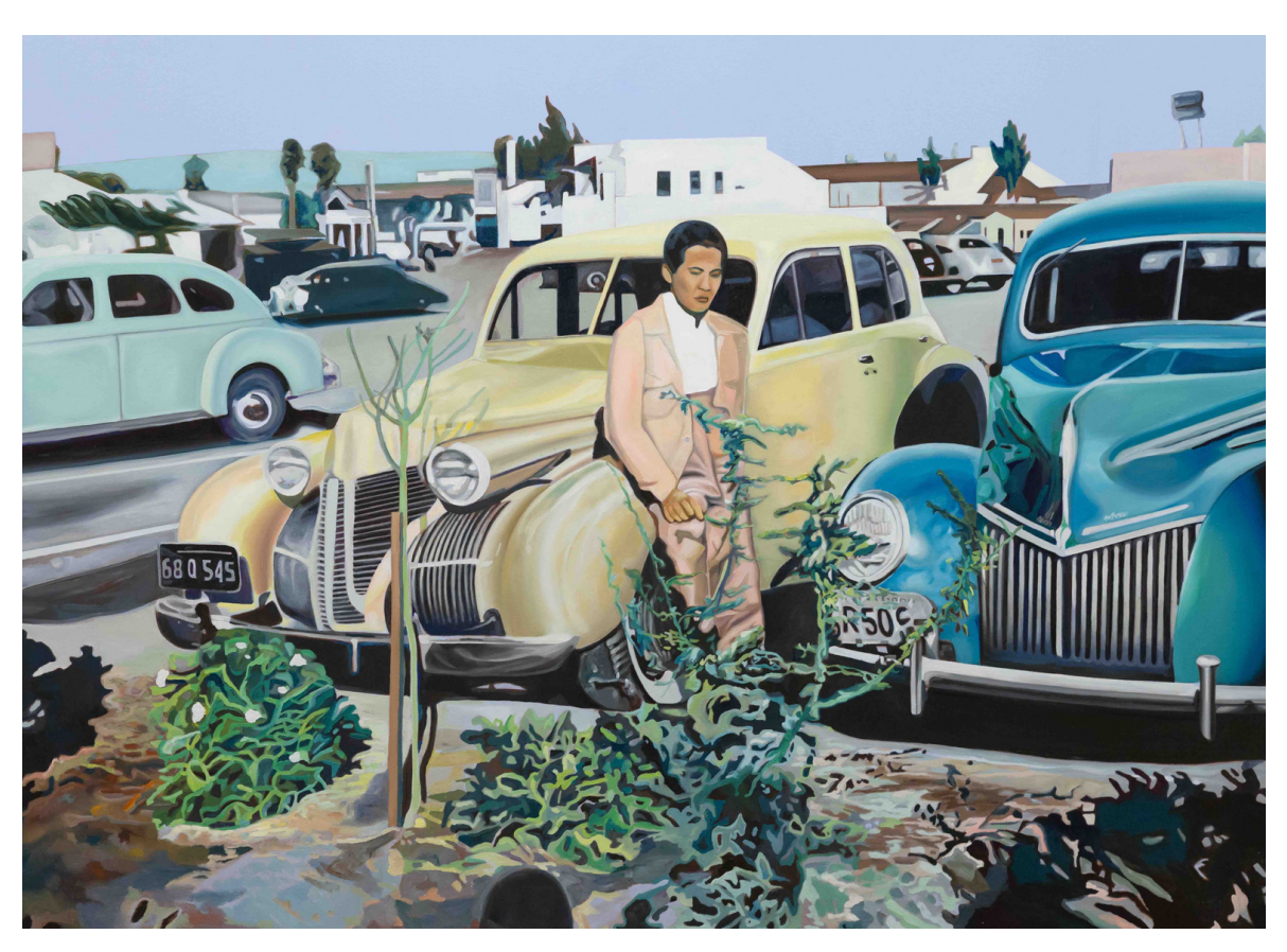
Manongs of Pajaro Valley, California #1 Oil on canvas, 140 x 196 cm, 2025