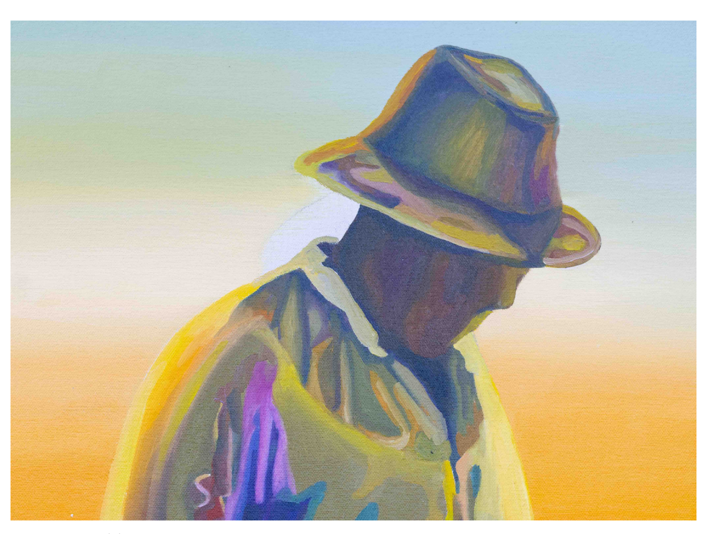
Manongs of Louisiana #2, oil on canvas, 152.4 x 122 cm, 2025, detail