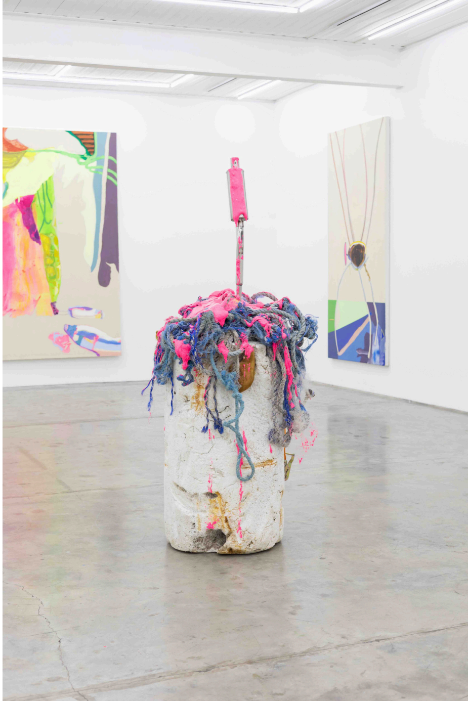
slug Styrofoam, rope, stainless steel, and resin, 175 x 76 x 34 cm, 2025