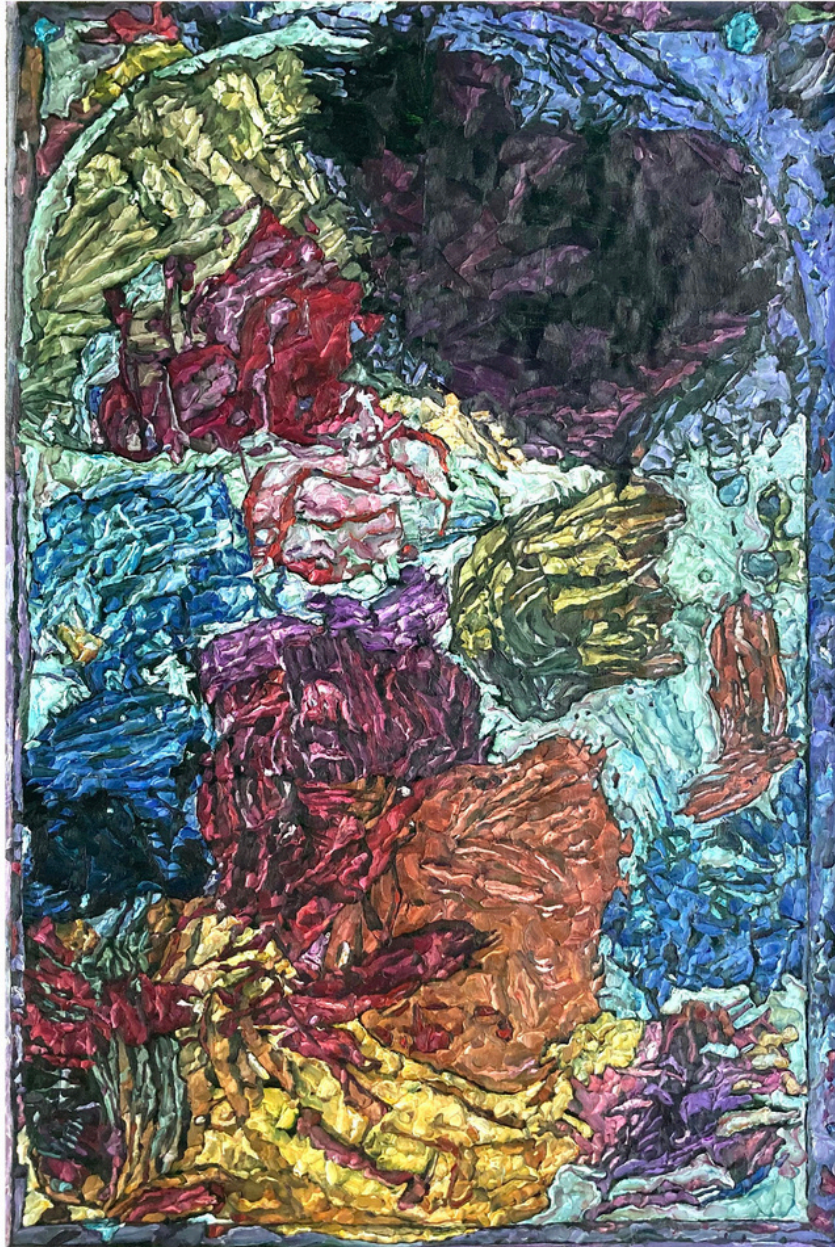
Leslie Oil on canvas 183 x 122 cm 2024