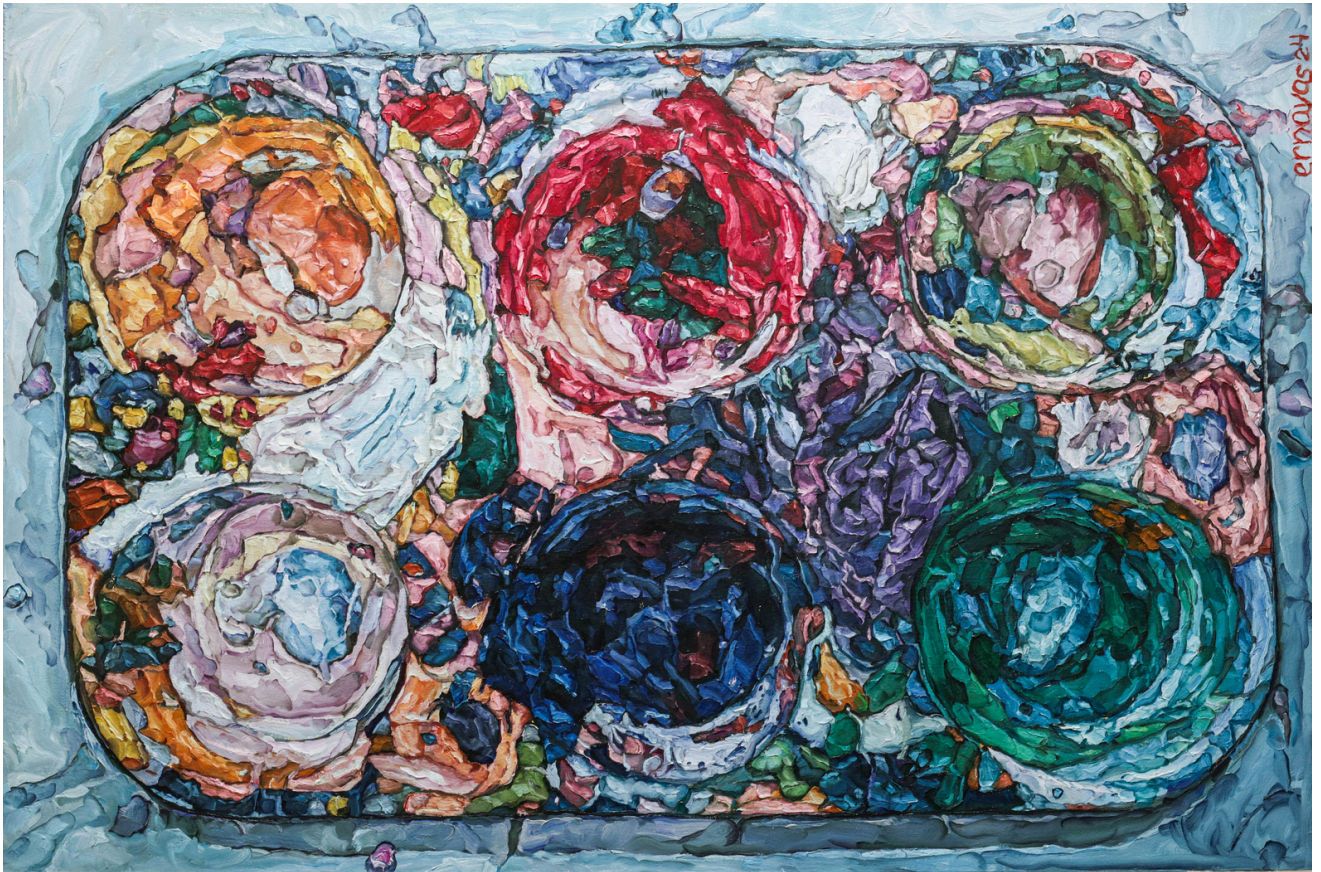
Yasmin Oil on canvas 183 x 122 cm 2024