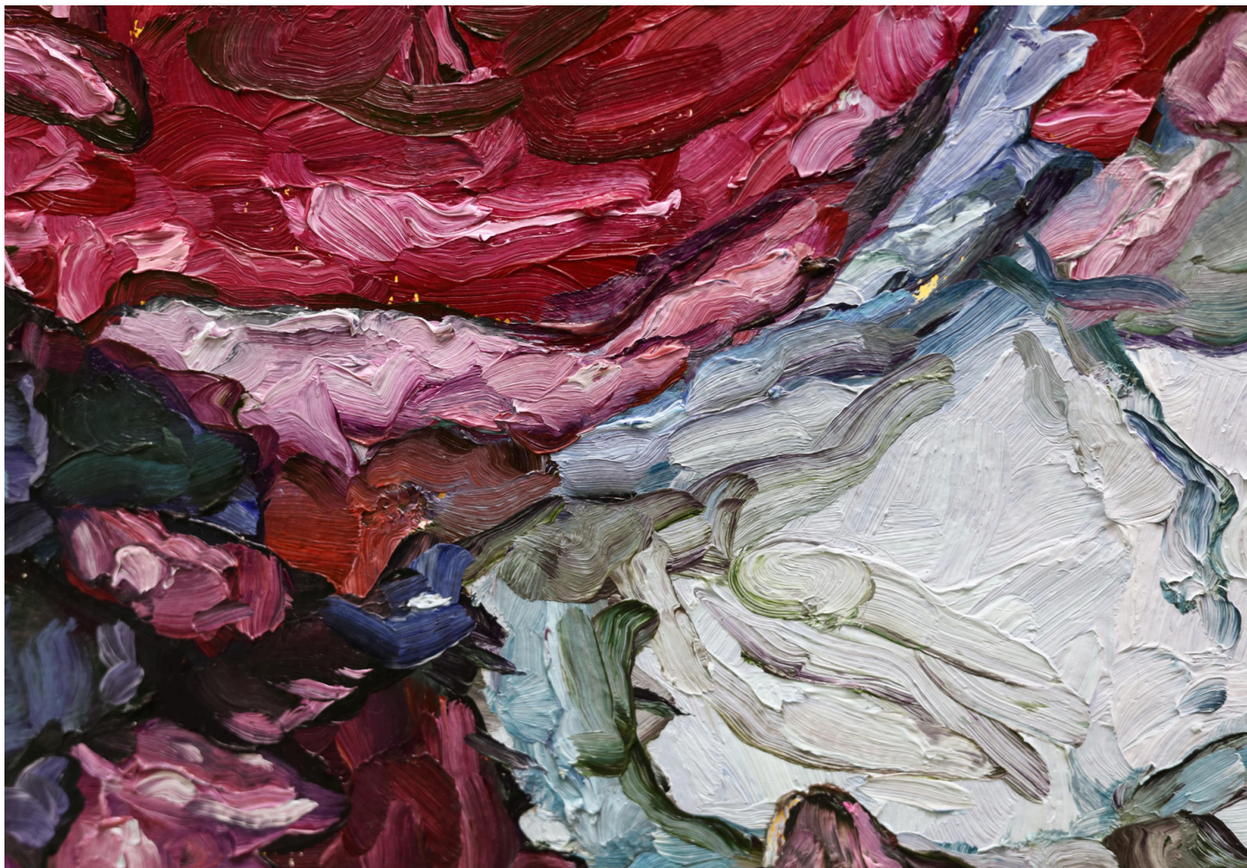
Yasmin , oil on canvas, 183 x 122 cm, 2024, detail

"The only color [in the room] is the paint itself—the canvas on the easel, and two palettes . The first of these is a slab, perhaps wood, perhaps stone, turgid with pigment inches thick. The second is an extraordinary object, the fossil of a wooden box upended...Warm colors are mixed on top of the box, cool ones on the shelf. Years of use have turned it into a block of pigment, its sides encrusted with glistening cakes and stalactites of the same magma that encrusts the floor." (Excerpt written by CLJ)