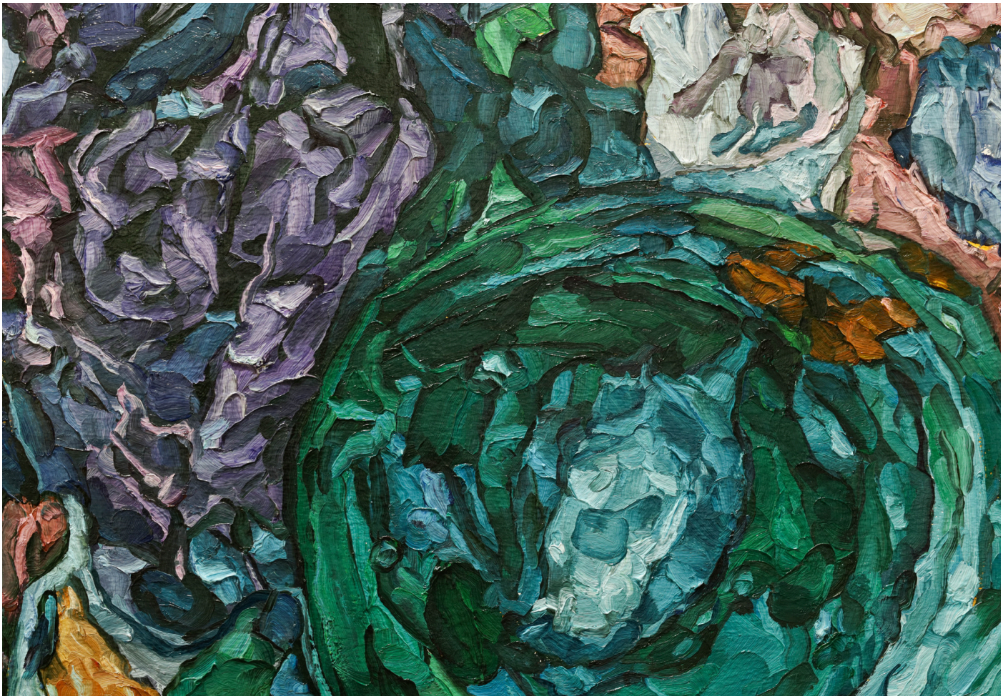
Yasmin , oil on canvas, 183 x 122 cm, 2024, detail

"The only color [in the room] is the paint itself—the canvas on the easel, and two palettes . The first of these is a slab, perhaps wood, perhaps stone, turgid with pigment inches thick. The second is an extraordinary object, the fossil of a wooden box upended...Warm colors are mixed on top of the box, cool ones on the shelf. Years of use have turned it into a block of pigment, its sides encrusted with glistening cakes and stalactites of the same magma that encrusts the floor." (Excerpt written by CLJ)