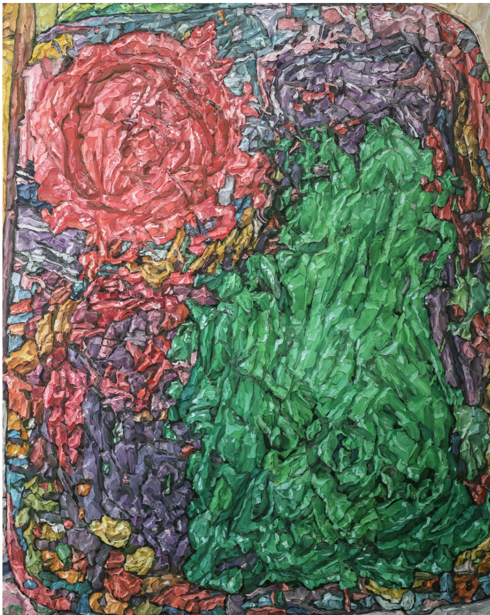
Pow Oil on canvas 152.4 x 122 cm 2024