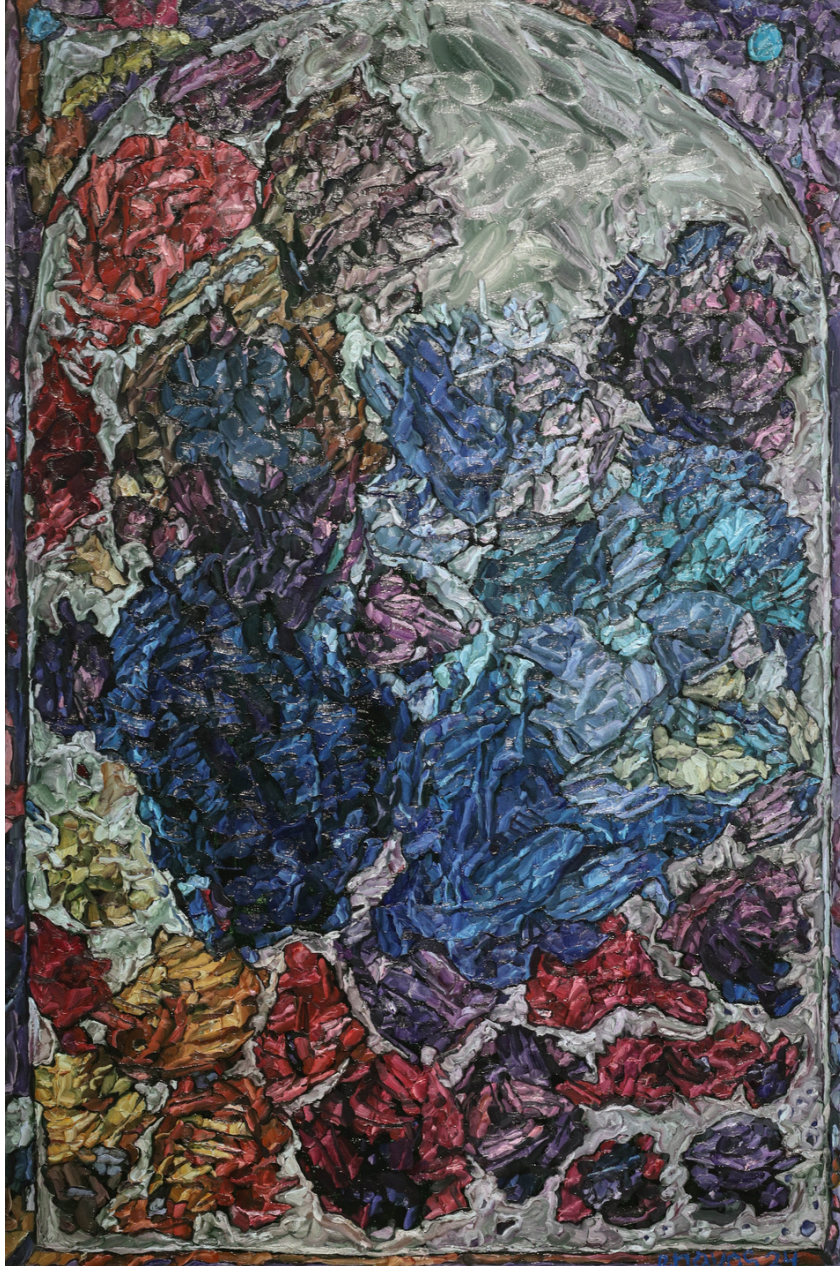
De Chavez Oil on canvas 183 x 122 cm 2024