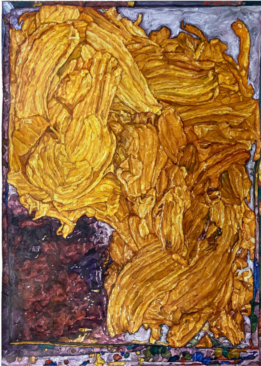
Elaine Oil on canvas 216 x 152.4 cm 2024