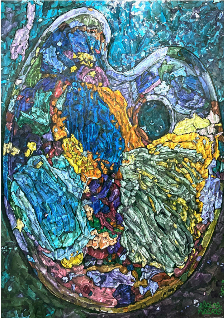
Manuel O. Oil on canvas 213.4 x 152.4 cm 2025