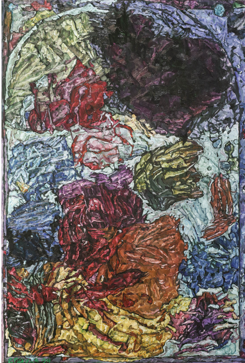
Leslie Oil on canvas 183 x 122 cm 2024