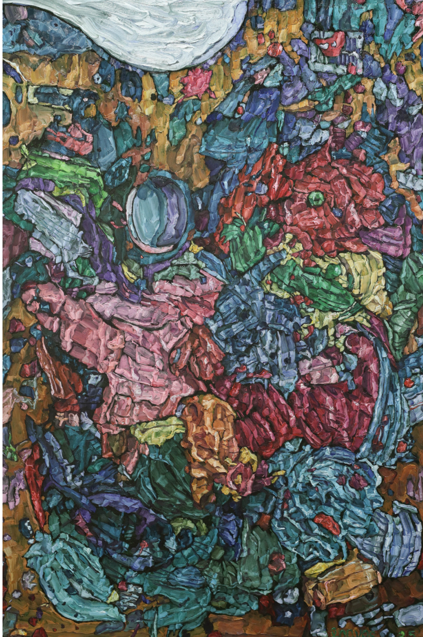
Manuel Oil on canvas 213.4 x 152.4 cm 2025