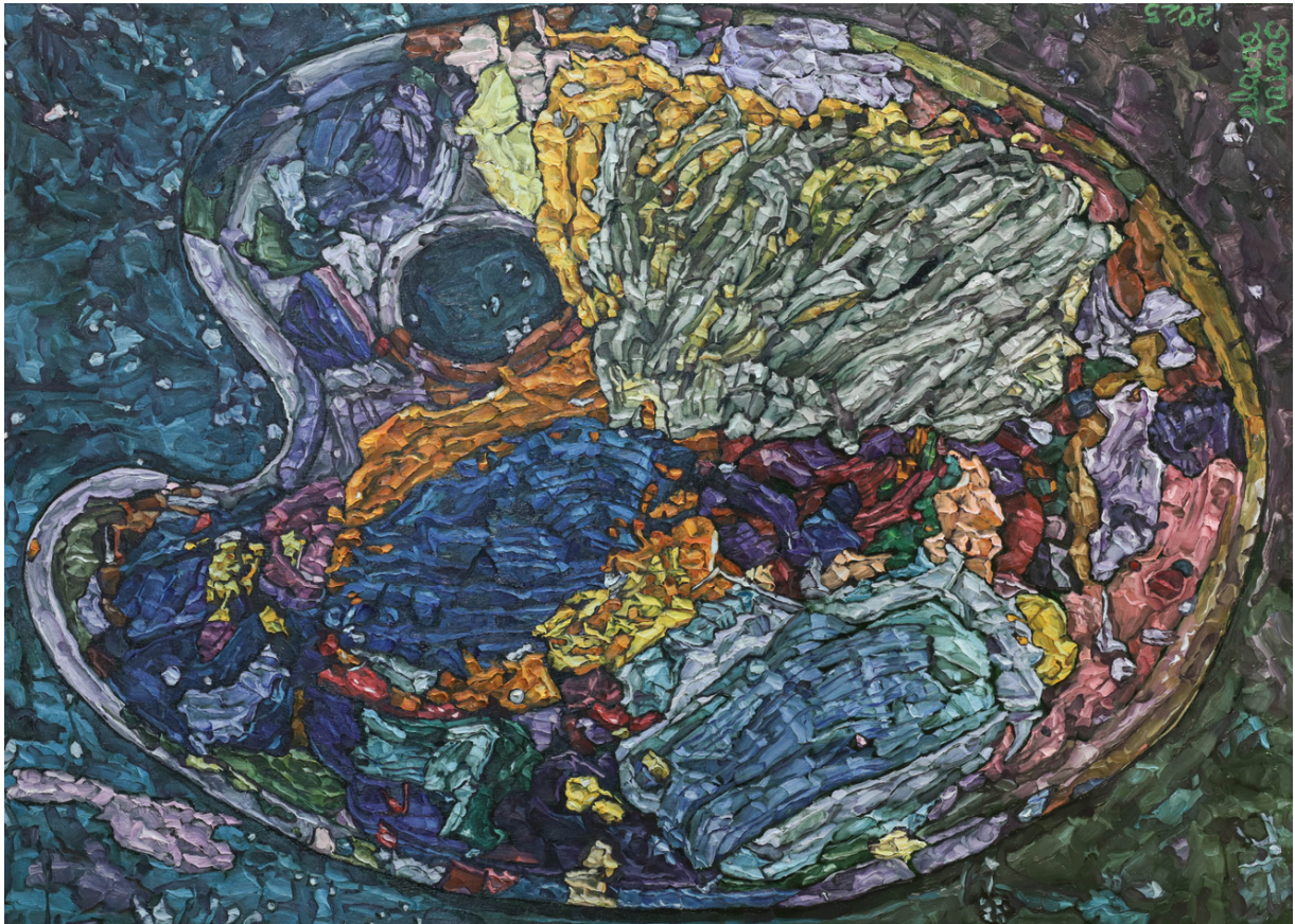
Manuel O. Oil on canvas 213.4 x 152.4 cm 2025