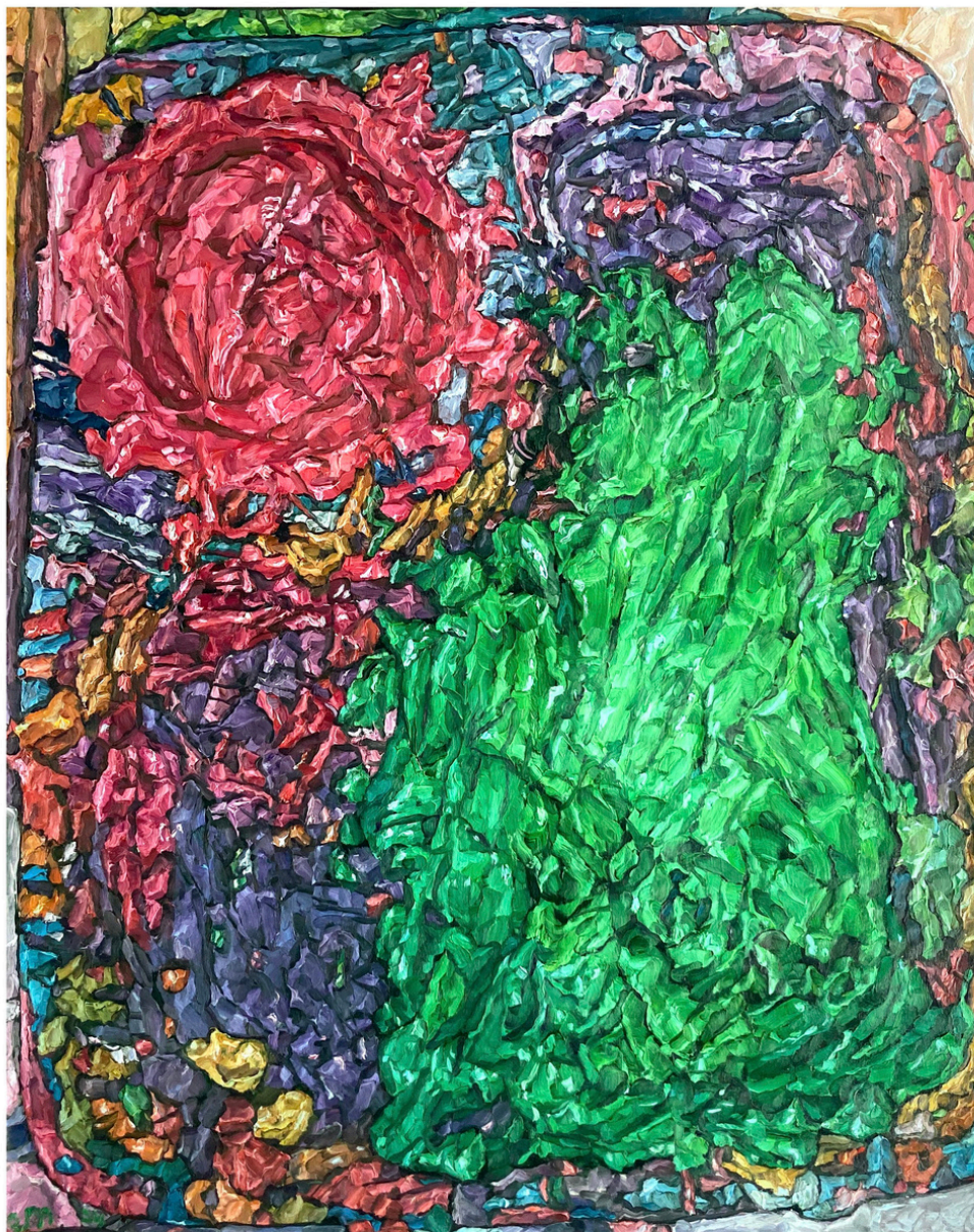
Pow Oil on canvas 152.4 x 122 cm 2024