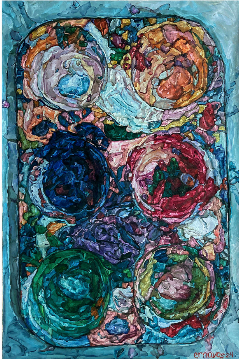
Yasmin Oil on canvas 183 x 122 cm 2024