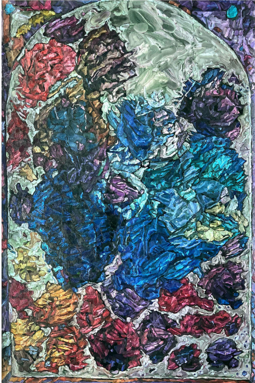
De Chavez Oil on canvas 183 x 122 cm 2024