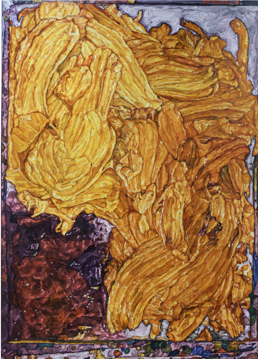
Elaine Oil on canvas 216 x 152.4 cm 2024