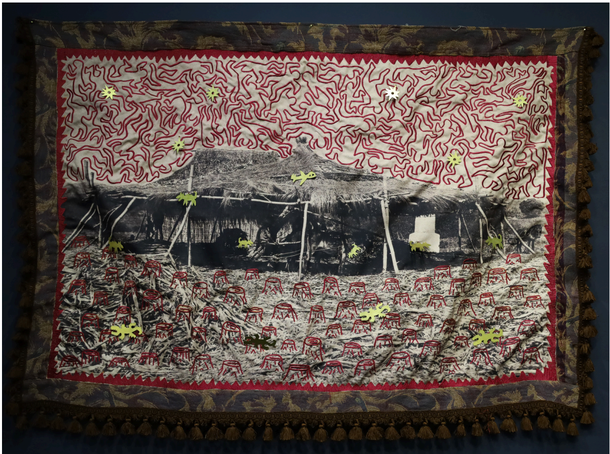
Embroidery, brass, digital print on fabric, 110.5 x 154 cm, 2024