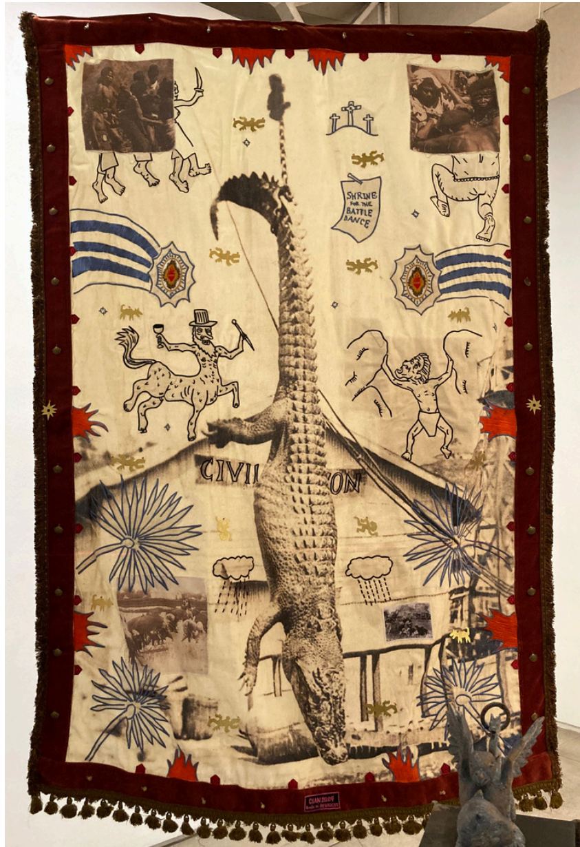
Objects, embroidery, digital print on fabric, 203 x 135 cm, 2024