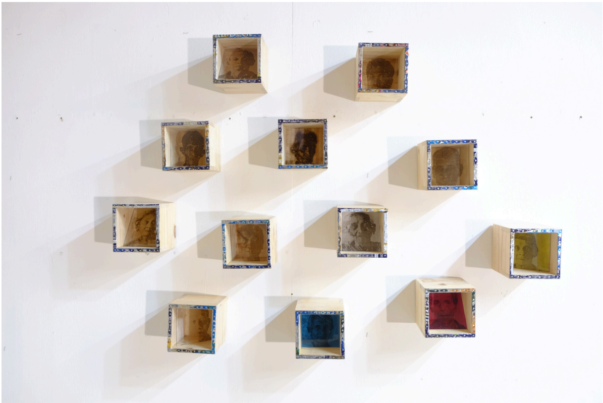
Wooden gantangan box, metal, print on Perspex, 12 x 12 cm, 2024