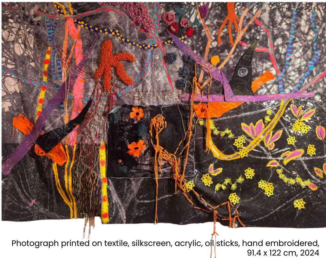
Photograph printed on textile, silkscreen, acrylic, oil sticks, hand embroidered, 91.4 x 122 cm, 2024