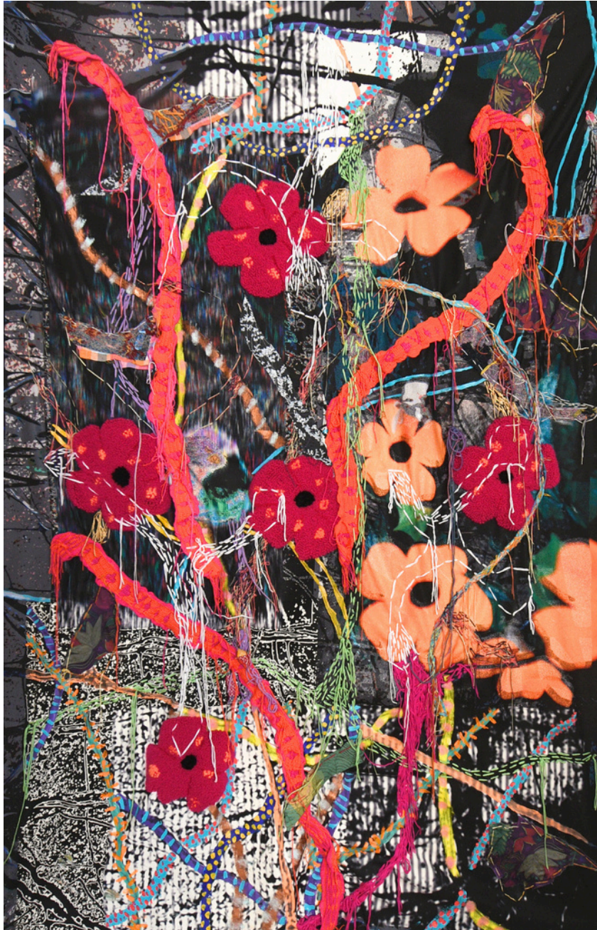
Photograph printed on textile, silkscreen, acrylic, oil sticks, hand embroidered, 213 x 152 cm, 2024