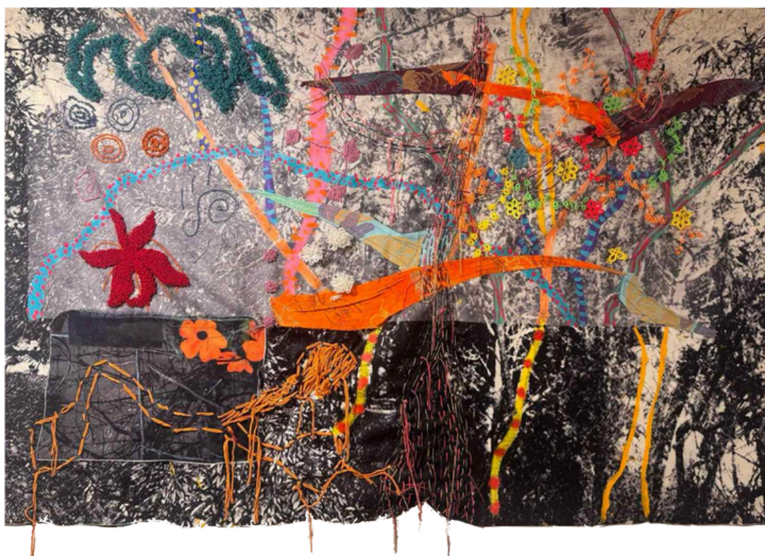
Photograph printed on textile, silkscreen, acrylic, oil sticks, hand embroidered, 91.4 x 122 cm, 2024