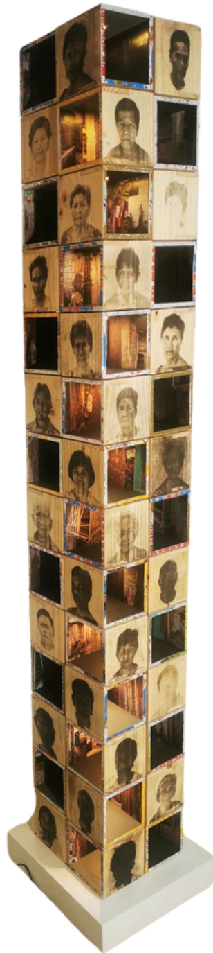
Wood, photo, print, LED lights, 210 x 40 x 40 cm, 2024