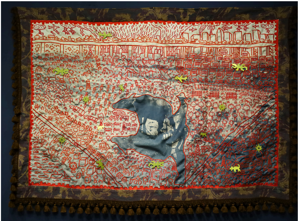
Embroidery, brass, digital print on fabric, 112 x 154 cm, 2024