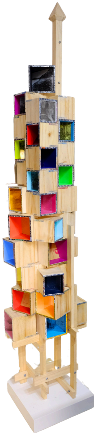
Wood, acrylic, metal, print on Perspex, 230 x 40 x 40 cm, 2024