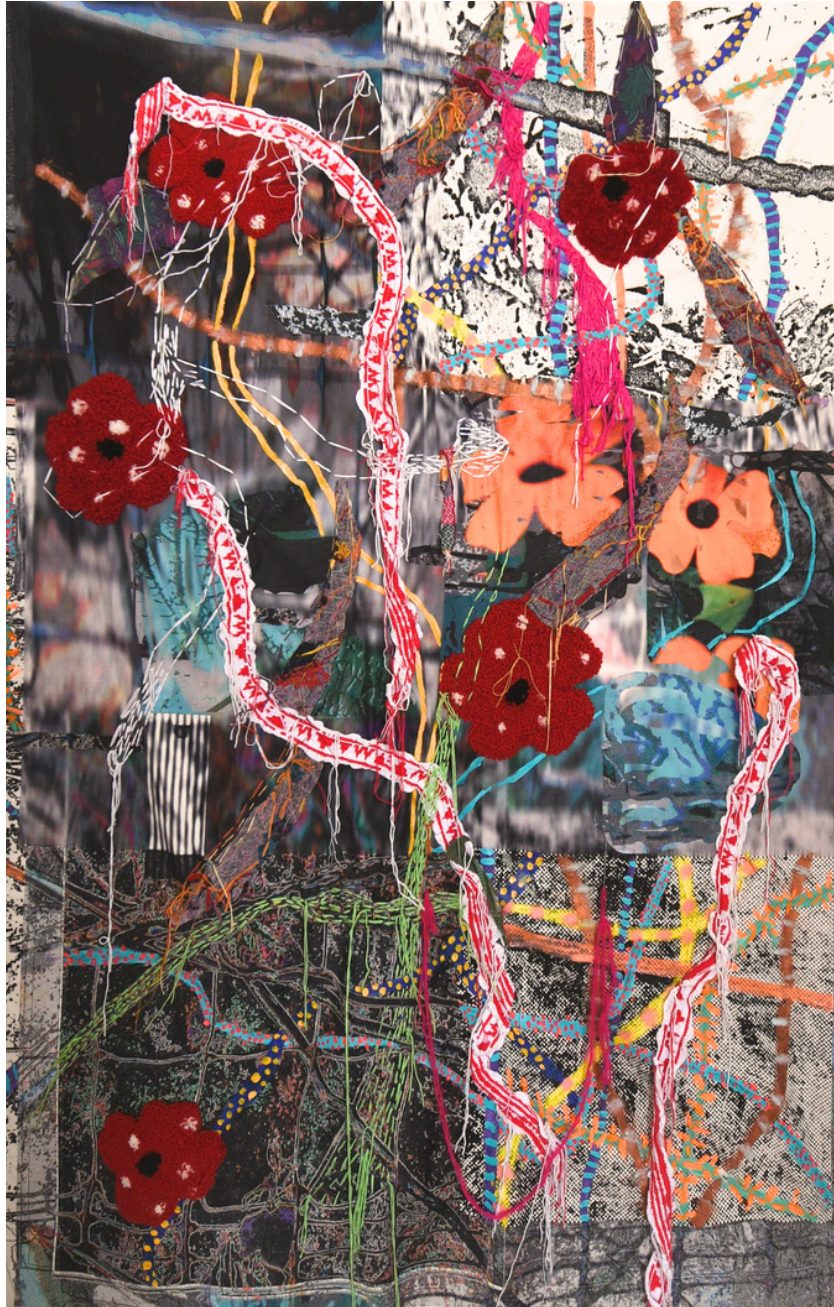
Photograph printed on textile, silkscreen, acrylic, oil sticks, hand embroidered, 213 x 152 cm, 2024