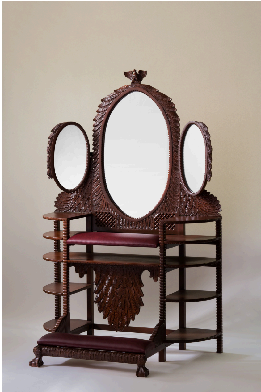
Mahogany woodwork, mirrors, leather, 183 x 152 x 122 cm, 2017, image courtesy of Neal Oshima, collaboration with Avelino Africa