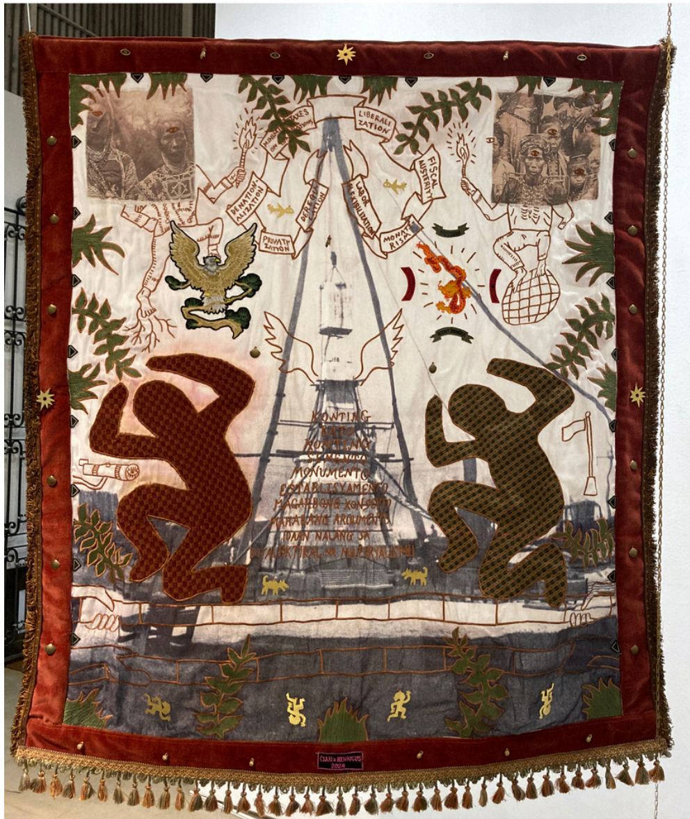
Objects, embroidery, digital print on fabric, 154 x 136 cm, 2024