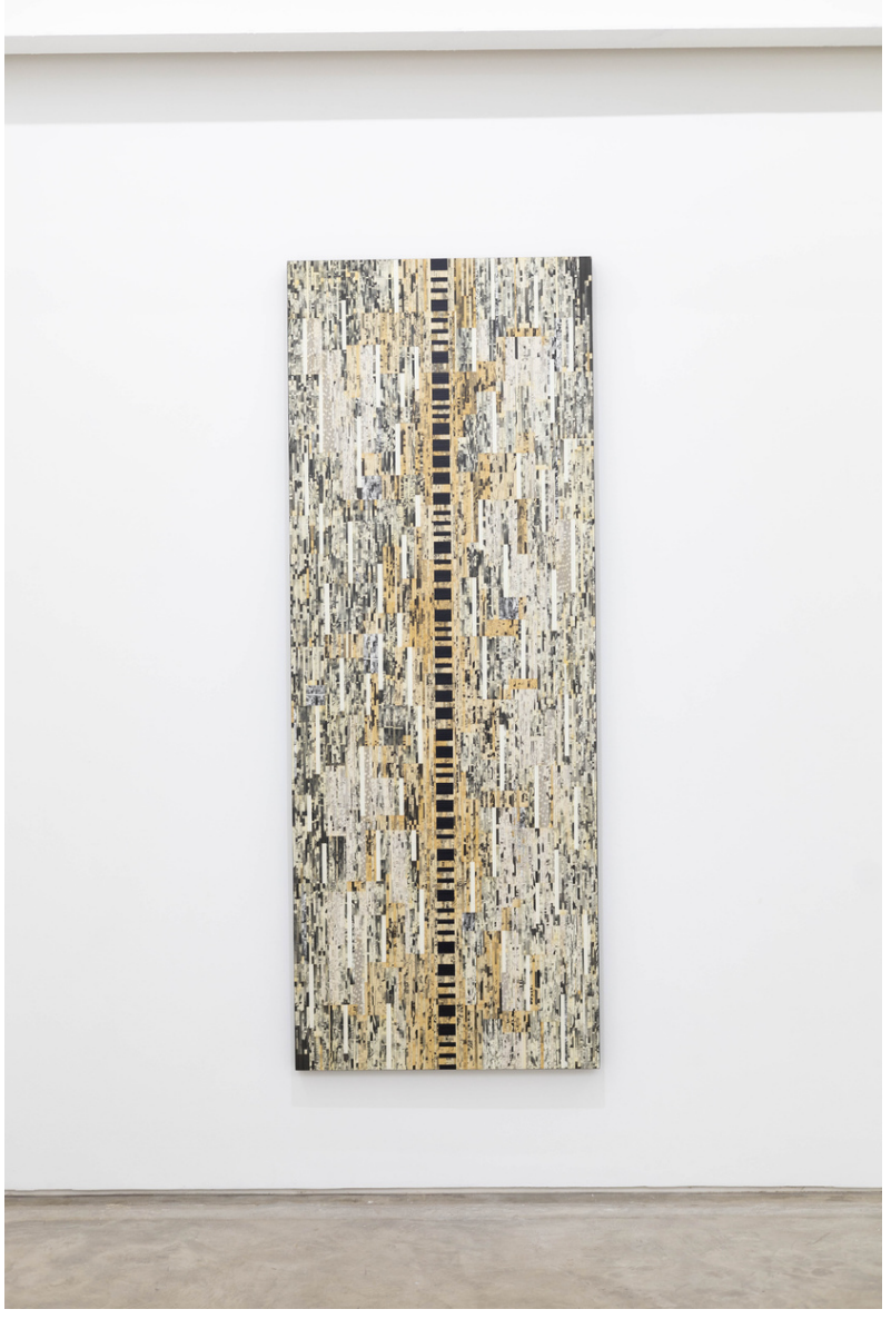
Collage on canvas panel (shredded manga pages, rice paper, acrylic emulsion, clear acrylic topcoat) 203 x 76.2 cm 2024