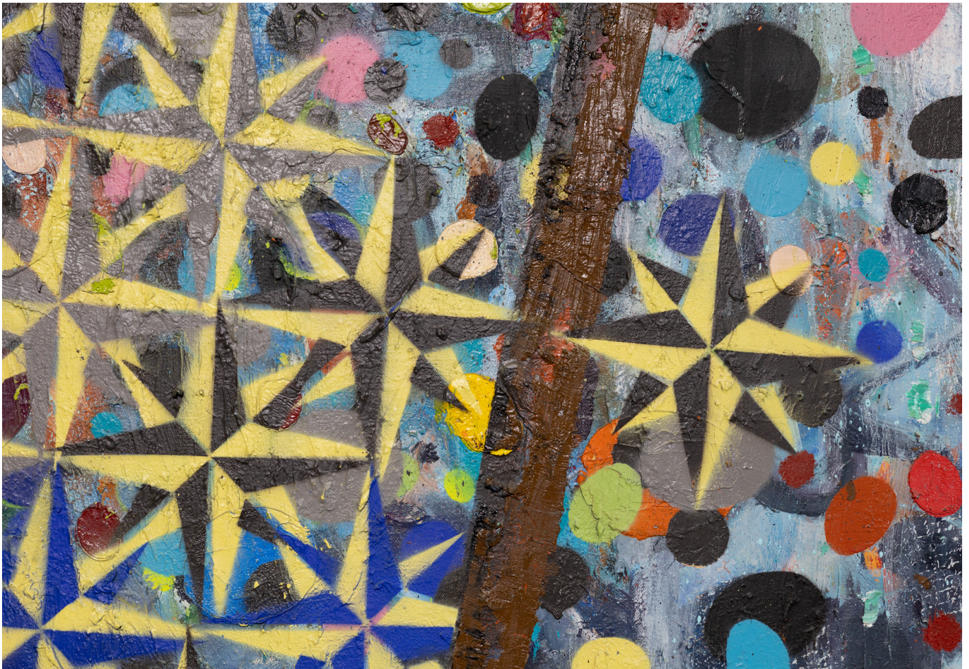
Gone Fishing (detail), oil on canvas, 170 x 170 cm, 2023