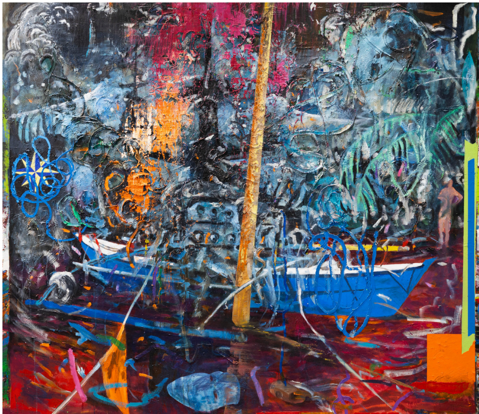
Oil on canvas 150 x 150 cm 2021