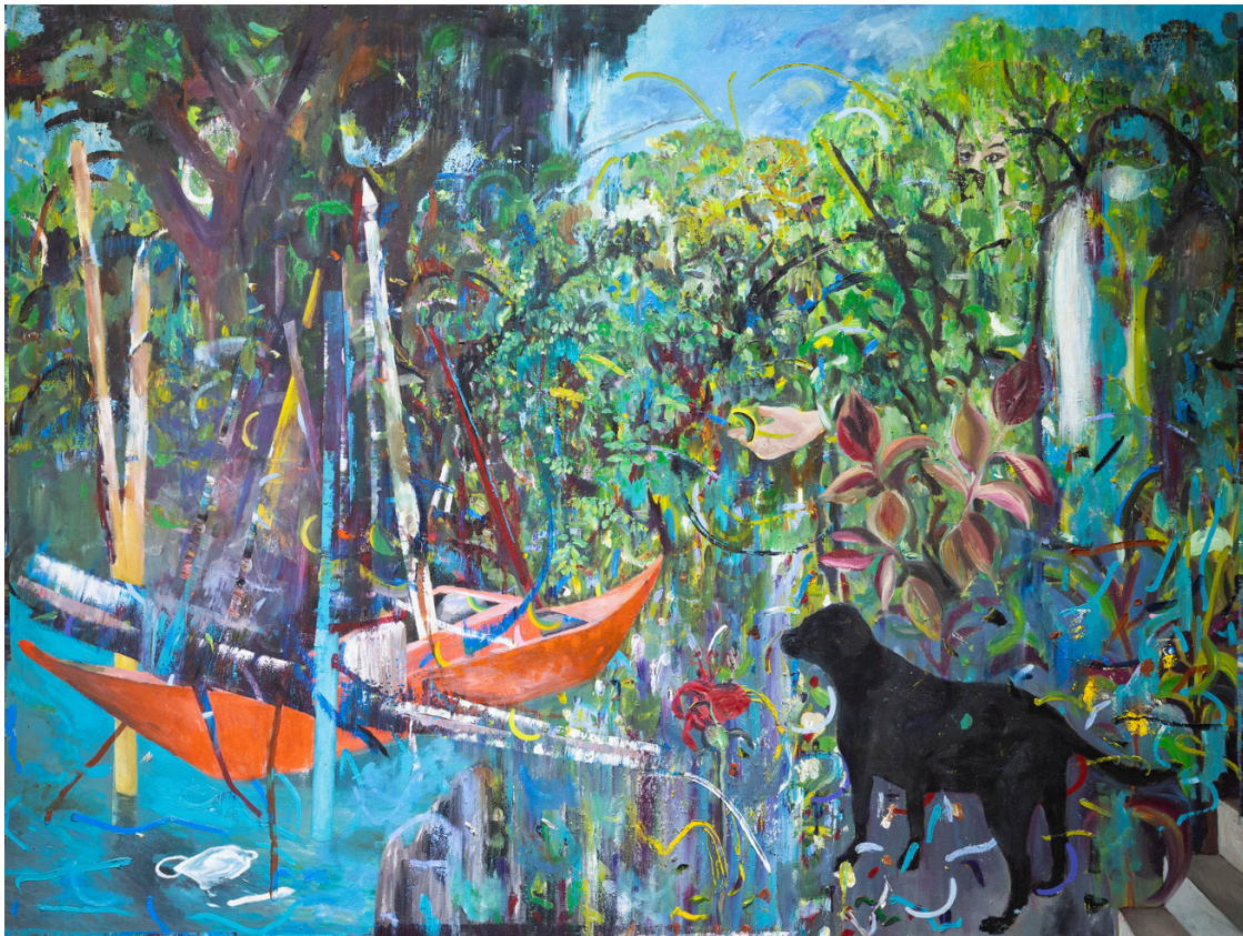
Oil on canvas 180 x 240 cm 2020