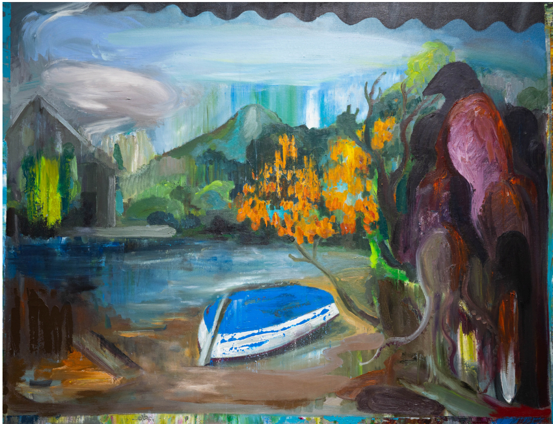
Oil on canvas 90 x 120 cm 2020