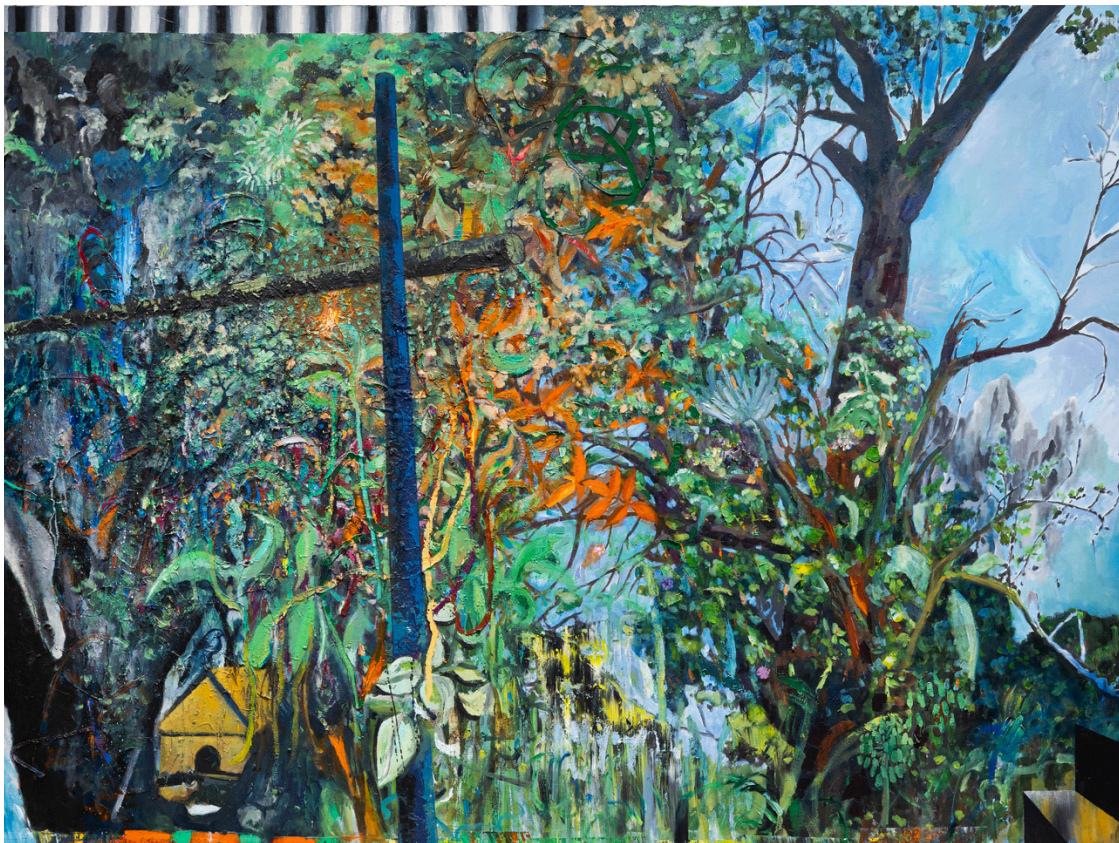
(On the cover) Oil on canvas 170 x 240 cm 2022