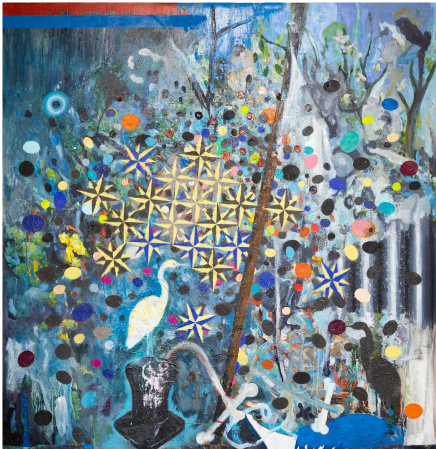
Oil on canvas 170 x 170 cm 2023