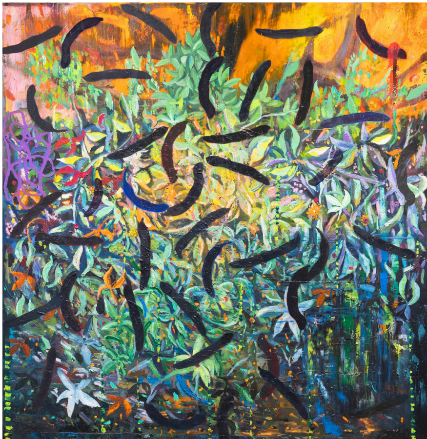
Oil on canvas 170 x 170 cm 2022