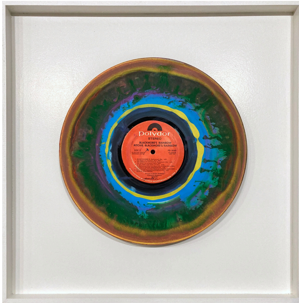
Acrylic on vinyl record, 48 x 48 cm, 2020-2023