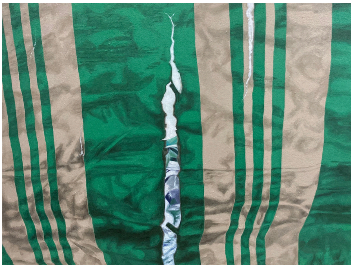
Oil on canvas, 46 x 61 cm, 2024