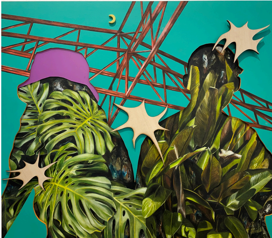
Oil and acrylic on wood, cast acrylic sheet, 53 x 61 cm, 2024