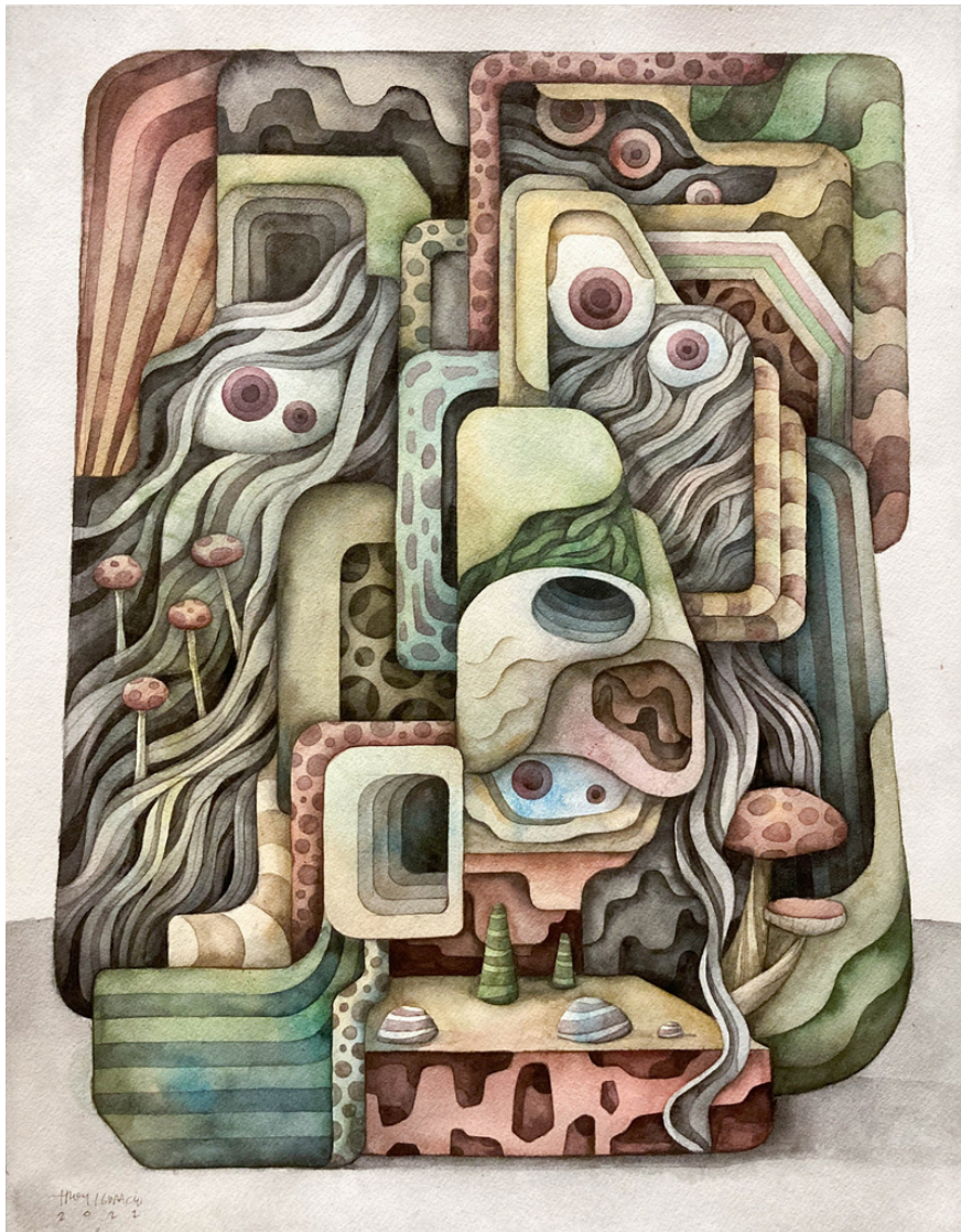
Watercolor on paper, 50.7 x 38 cm, 2022