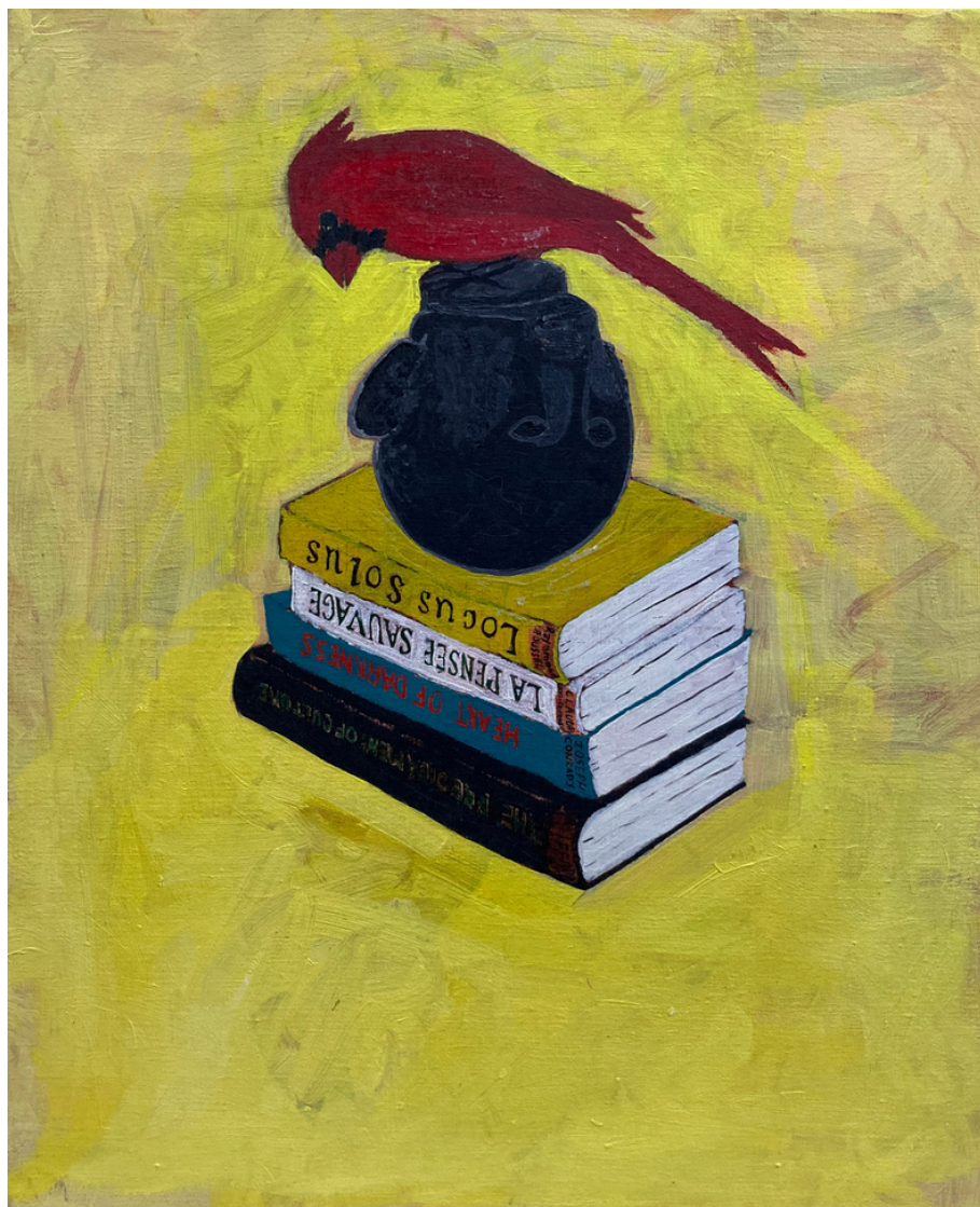
Oil on canvas, 61 x 51 cm, 2023