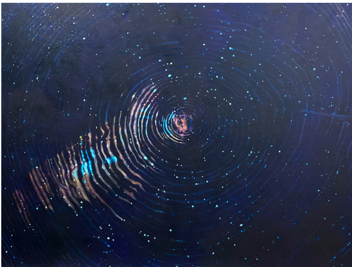
Oil on canvas, 91.4 x 122 cm, 2024