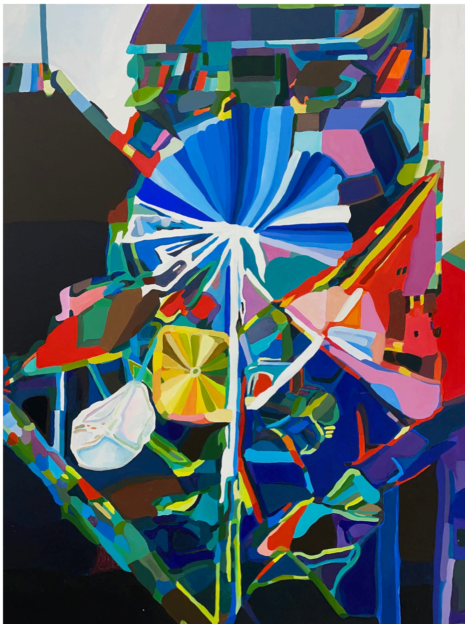
Oil on canvas, 122 x 91.4 cm, 2024