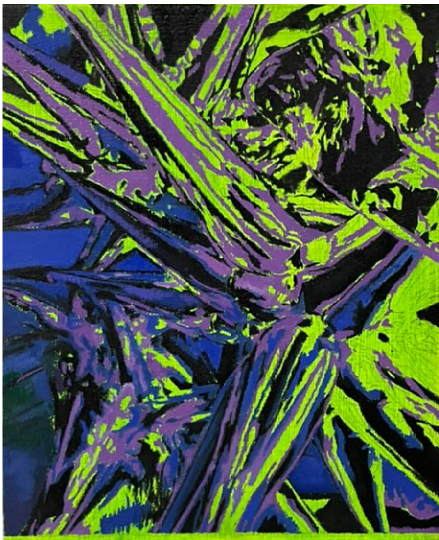
Acrylic on canvas, 30.5 x 25.4 cm, 2024