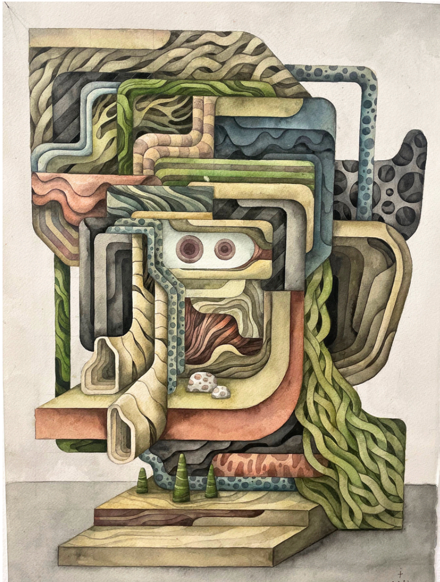
Watercolor on paper, 50.5 x 37.8 cm, 2021