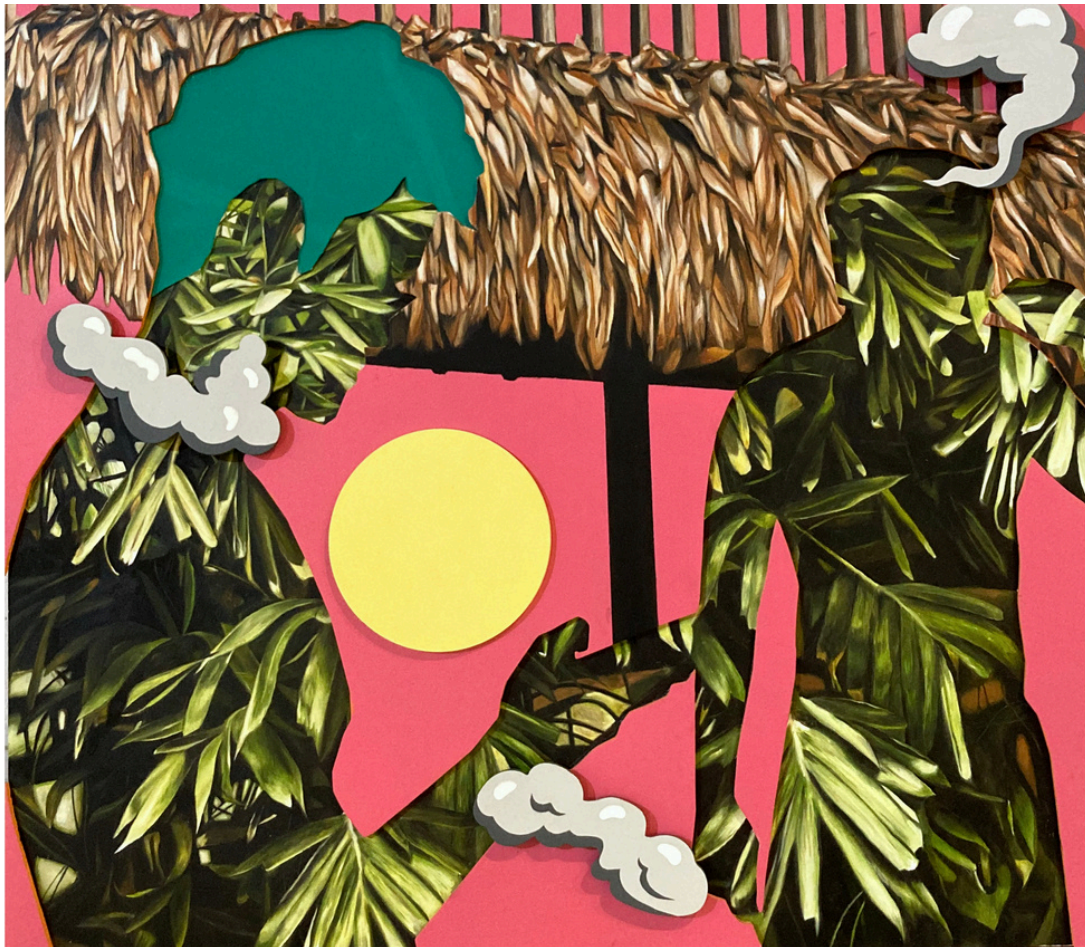
Oil and acrylic on wood, cast acrylic sheet, 53 x 61 cm, 2024