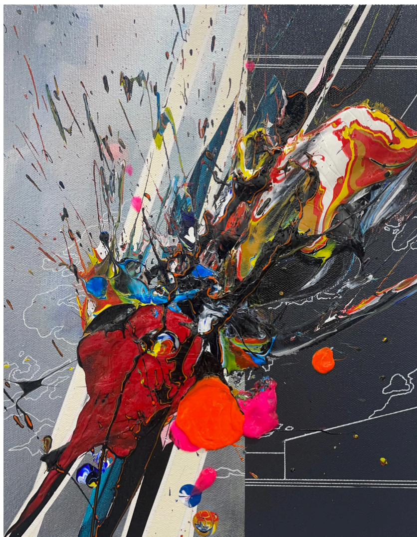
Acrylic on canvas, 36 x 28 cm, 2024