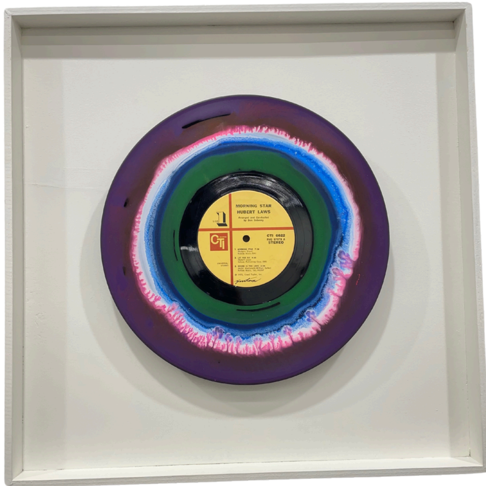
Acrylic on vinyl record, 48 x 48 cm, 2020-2023