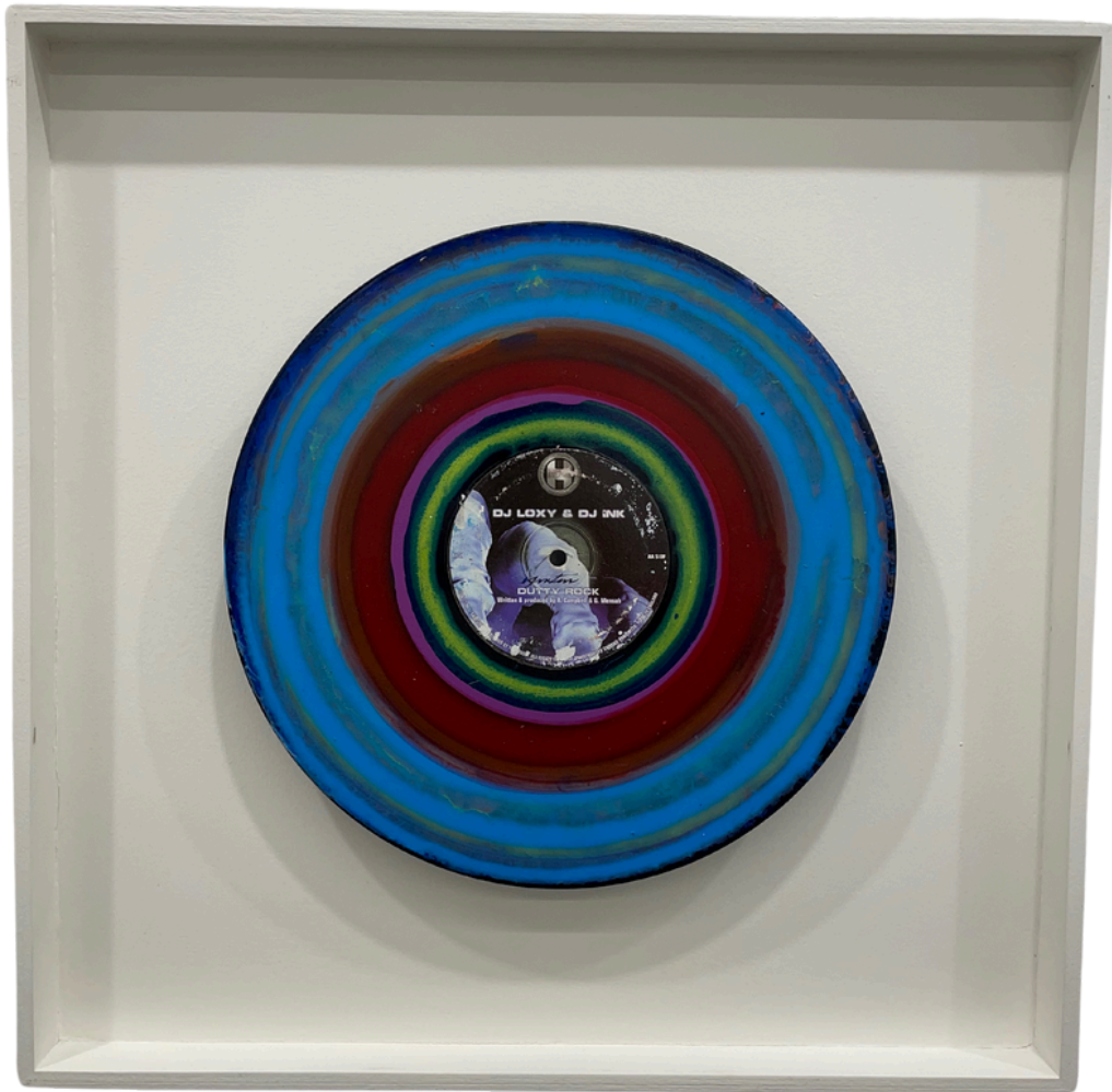
Acrylic on vinyl record, 48 x 48 cm, 2020-2023