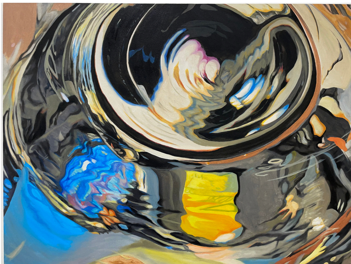
Oil on canvas, 91.4 x 122 cm, 2024