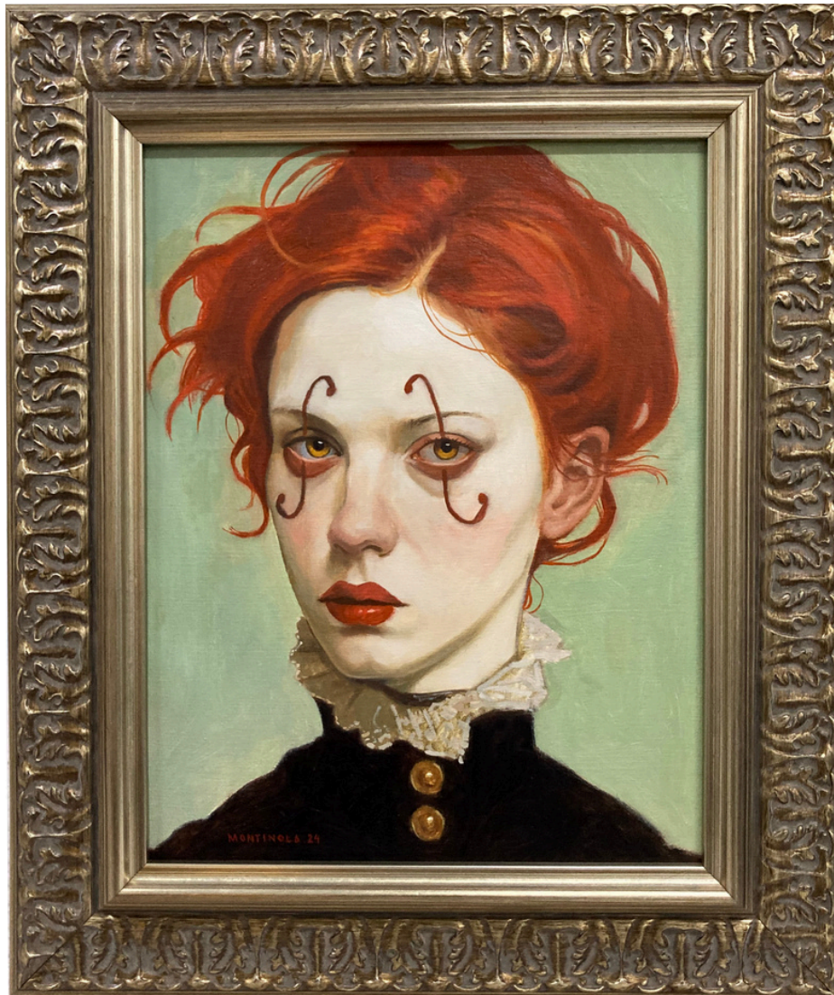
Oil on canvas, 48 x 28 cm, 2024