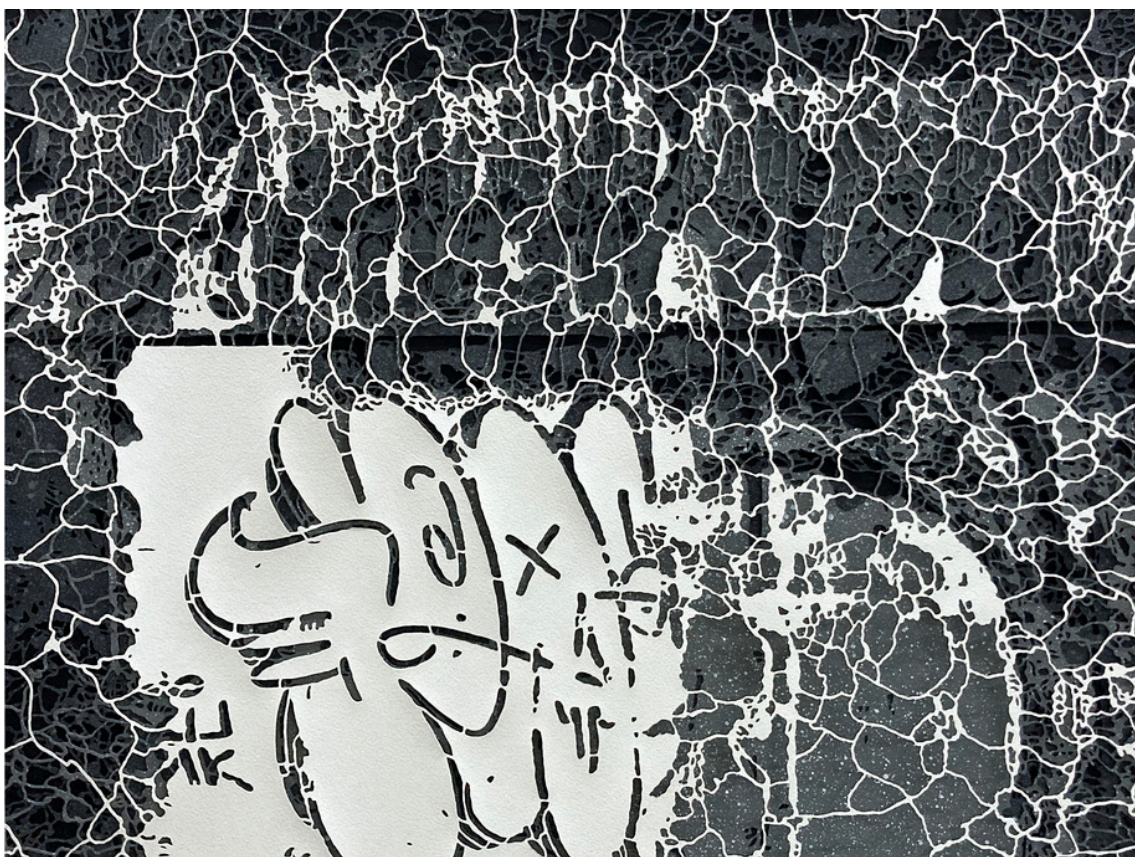
Four-layer paper cut out on Arches Aquarelle 185 gsm, 46 x 61 cm, 2024