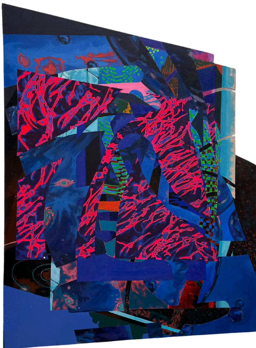
Oil and acrylic on wood panel, 37 x 26 in, 2024