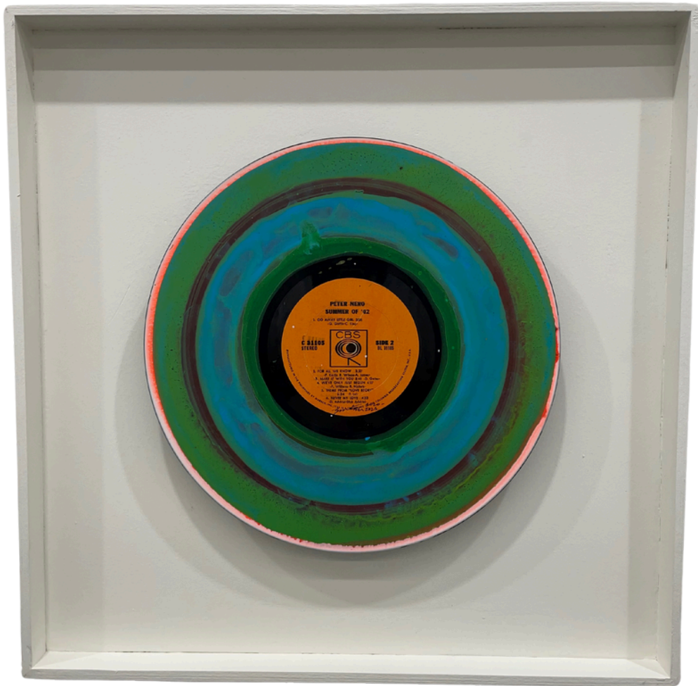
Acrylic on vinyl record, 48 x 48 cm, 2020-2023