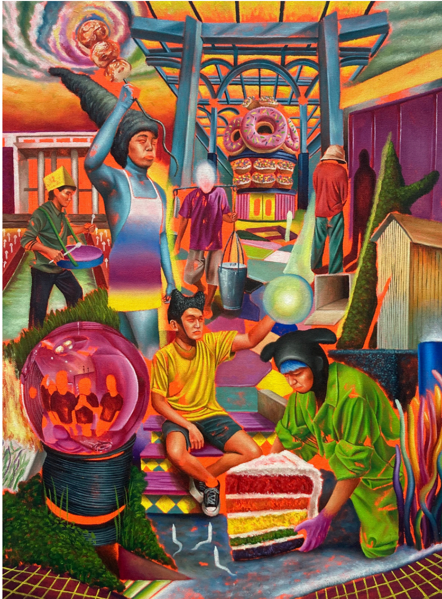
Oil on canvas, 61 x 53 cm, 2024