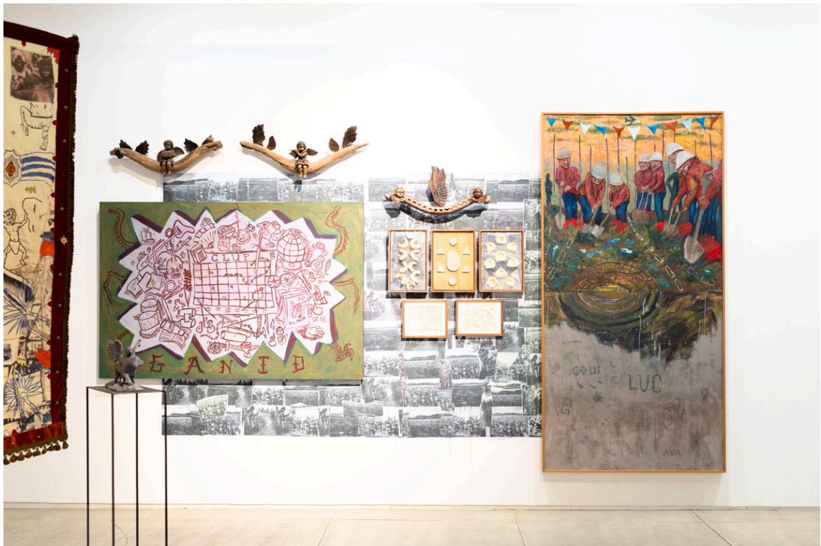
Oil, acrylic on wood, print, brass, metal, woodwork 2024