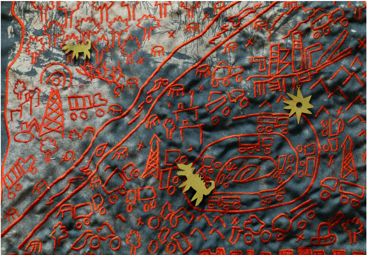
Studies on the Built Environment (detail), installation, 2024.