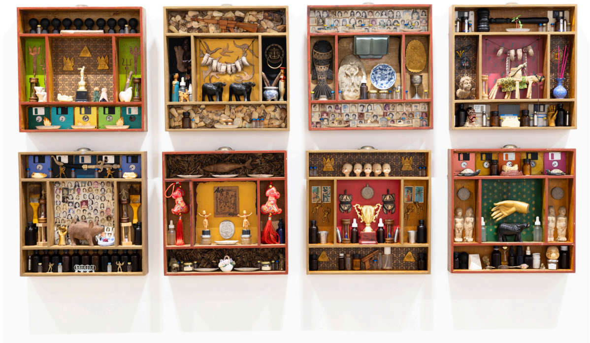
Assemblage of found objects, wood 2024