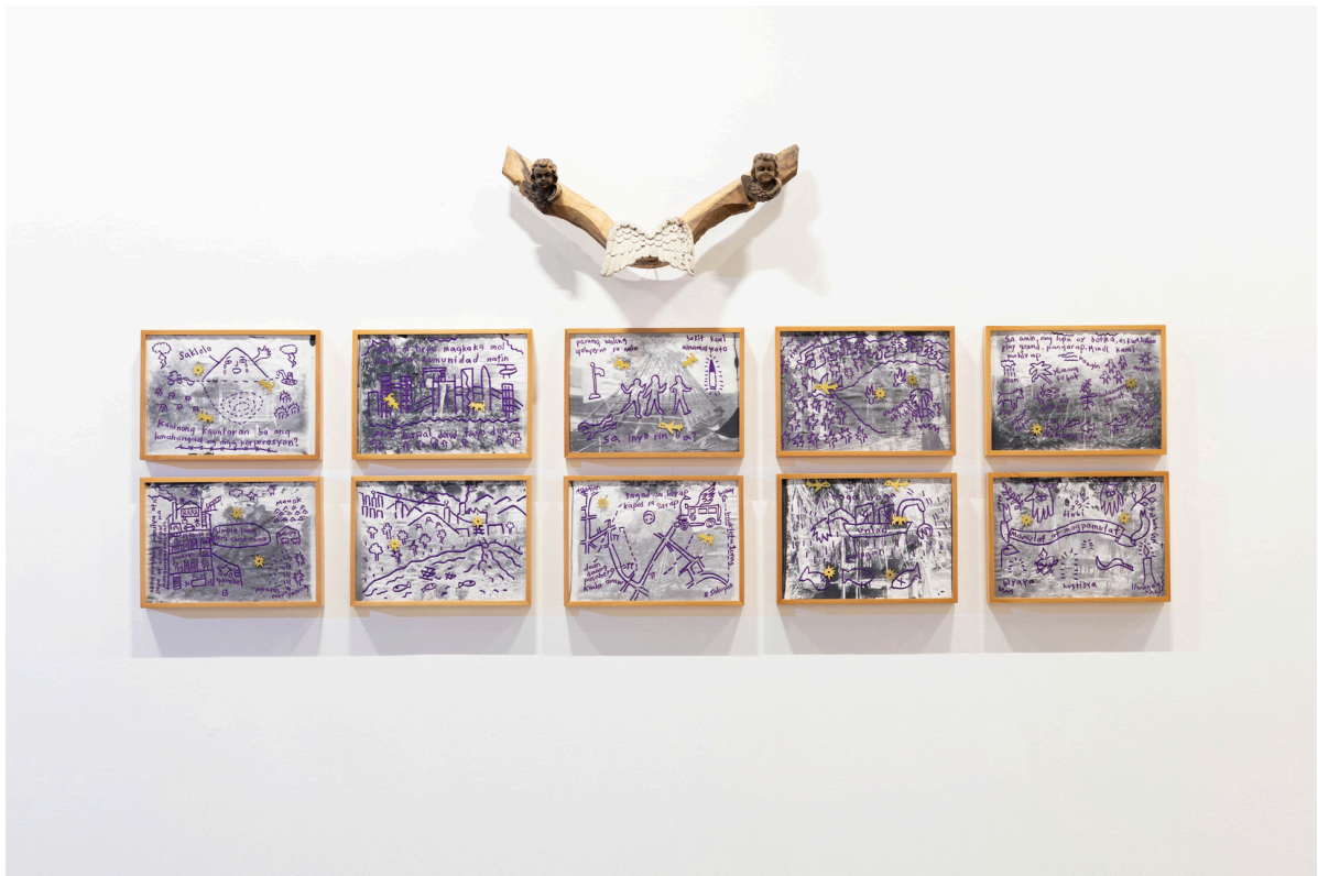
Embroidery, brass on wooden panel 2024