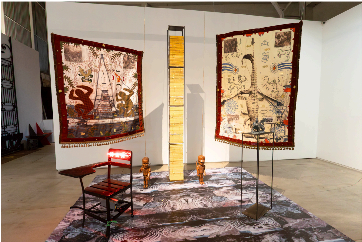
Print on fabric, woodwork, neon lights, metal, found objects 2024