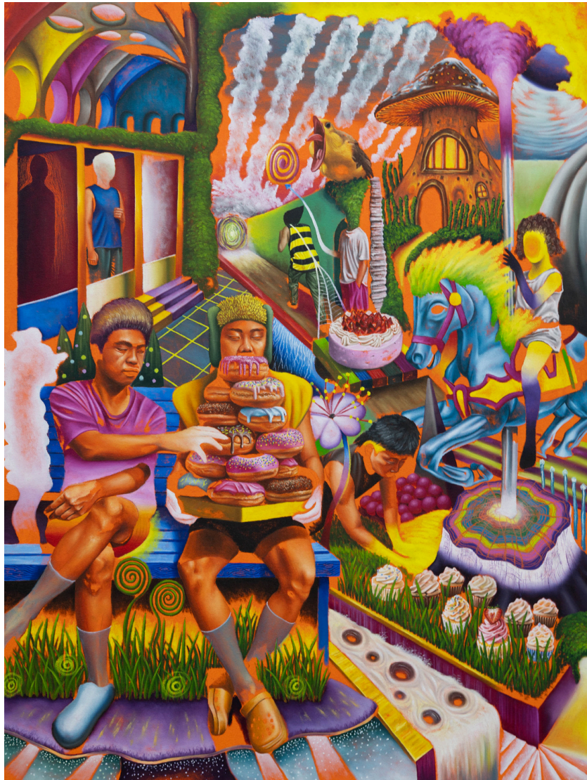
Oil on canvas 122 x 91.4 cm 2024