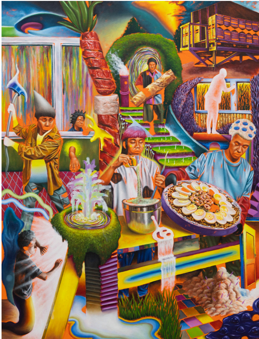
Oil on canvas 122 x 91.4 cm 2024