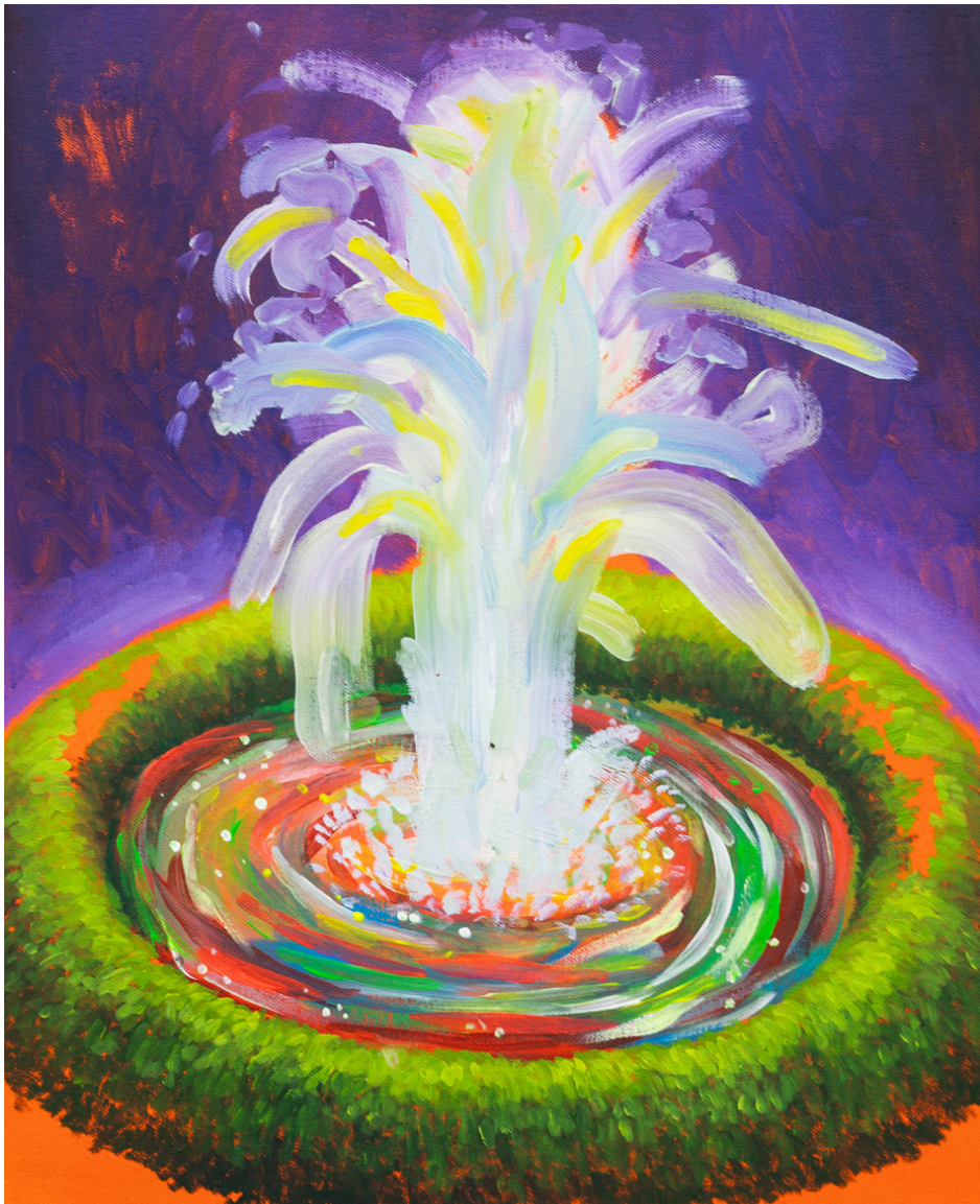
Oil on canvas 51 x 41 cm 2024