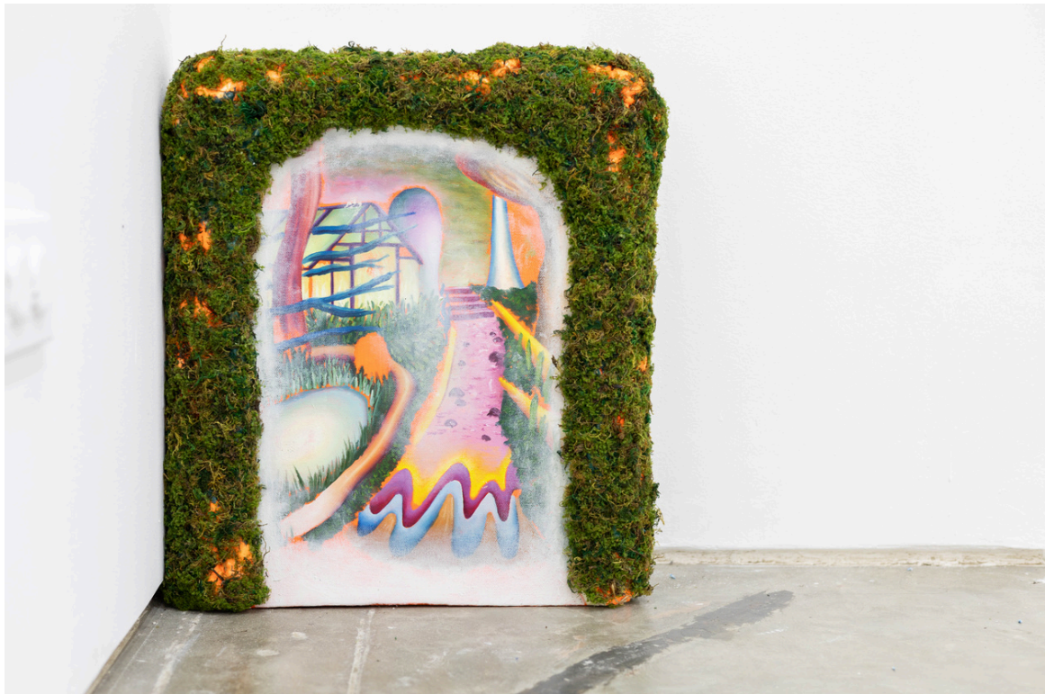
Mixed media on canvas 42 x 34 cm 2024