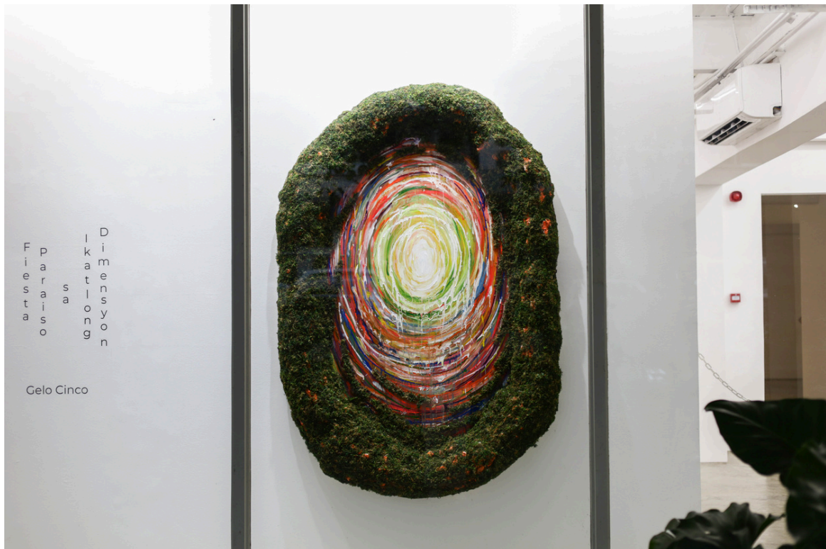
Mixed media on tarpaulin 152.4 x 122 cm 2024