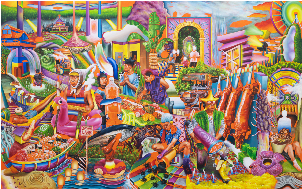
(On the cover) Oil on canvas 152.4 x 244 cm 2024