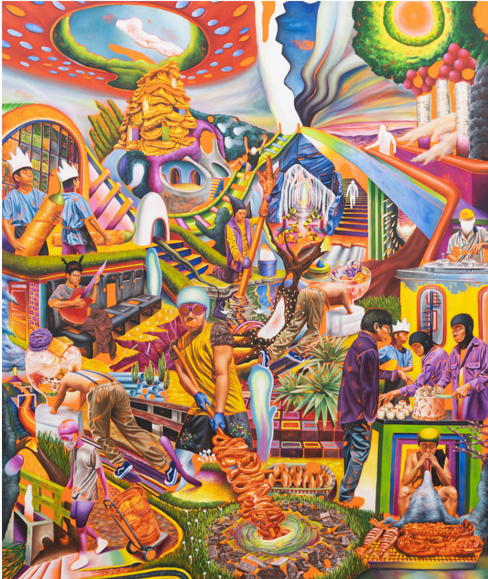
Oil on canvas 183 x 152.4 cm 2024