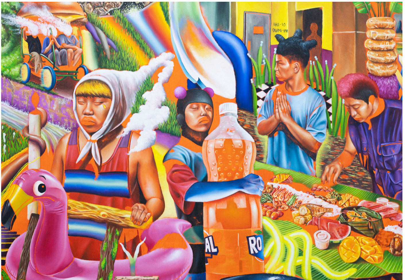
Ang pista ng lasa at gunita: Halu-halong gulo sakto sa panlasa (detail), oil on canvas, 152.4 x 244 cm, 2024.