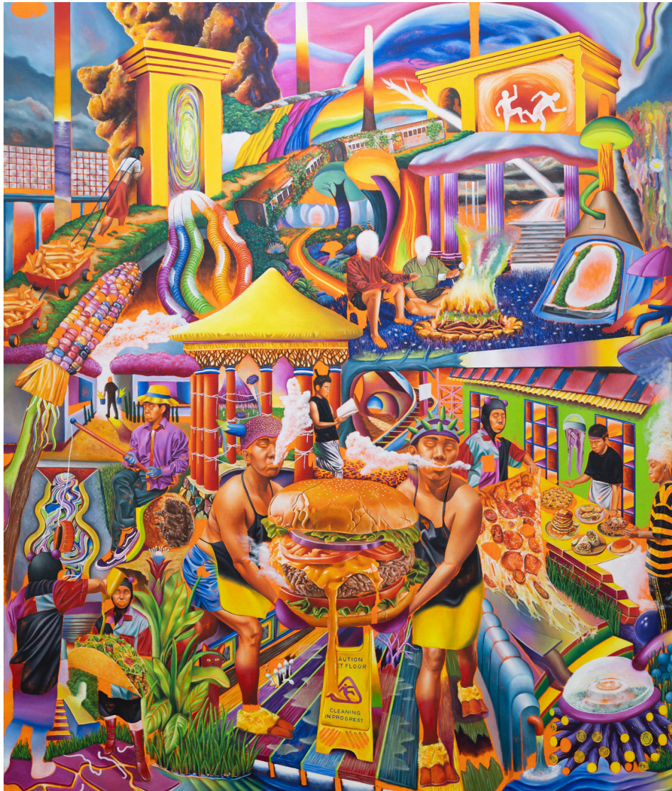
Oil on canvas 183 x 152.4 cm 2024