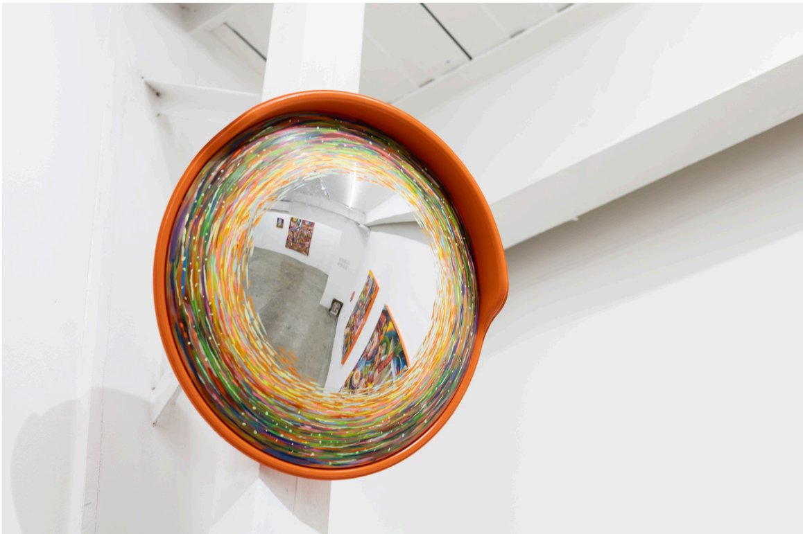
Acrylic on mirror 43.2 x 43.2 cm 2024