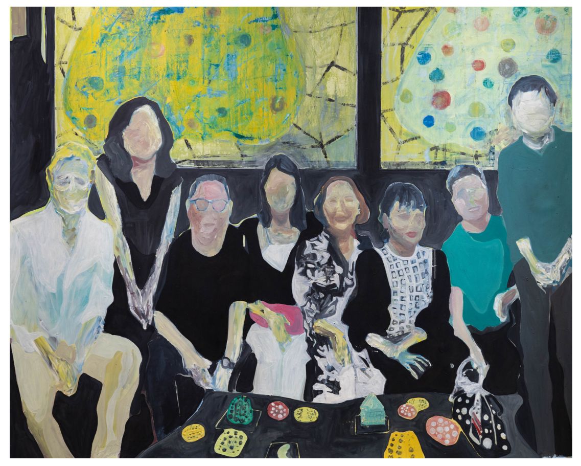
Oil, cold wax on paper 150 x 183 cm 2023