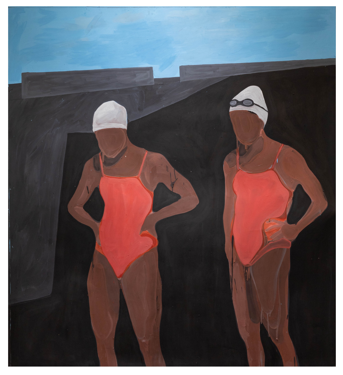
Oil, cold wax on paper 150 x 135 cm 2023