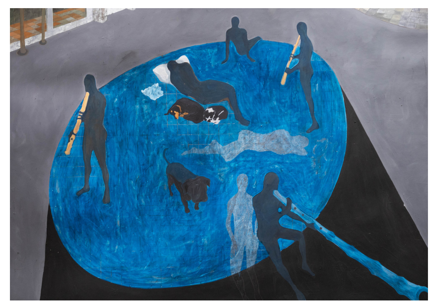
Untitled (close-up), oil and cold wax on paper, 150 x 171.4 cm, 2023.

While looking at the works for "Sunday Paintings" and thinking of what to say about them I remembered a Japanese phrase "mono no aware". Most of the works I do be it figurative abstract or print have a distinct melancholy about them. But mono no aware is a much better description. It means "the pathos of things... a melancholic appreciation of the transiency of existence."