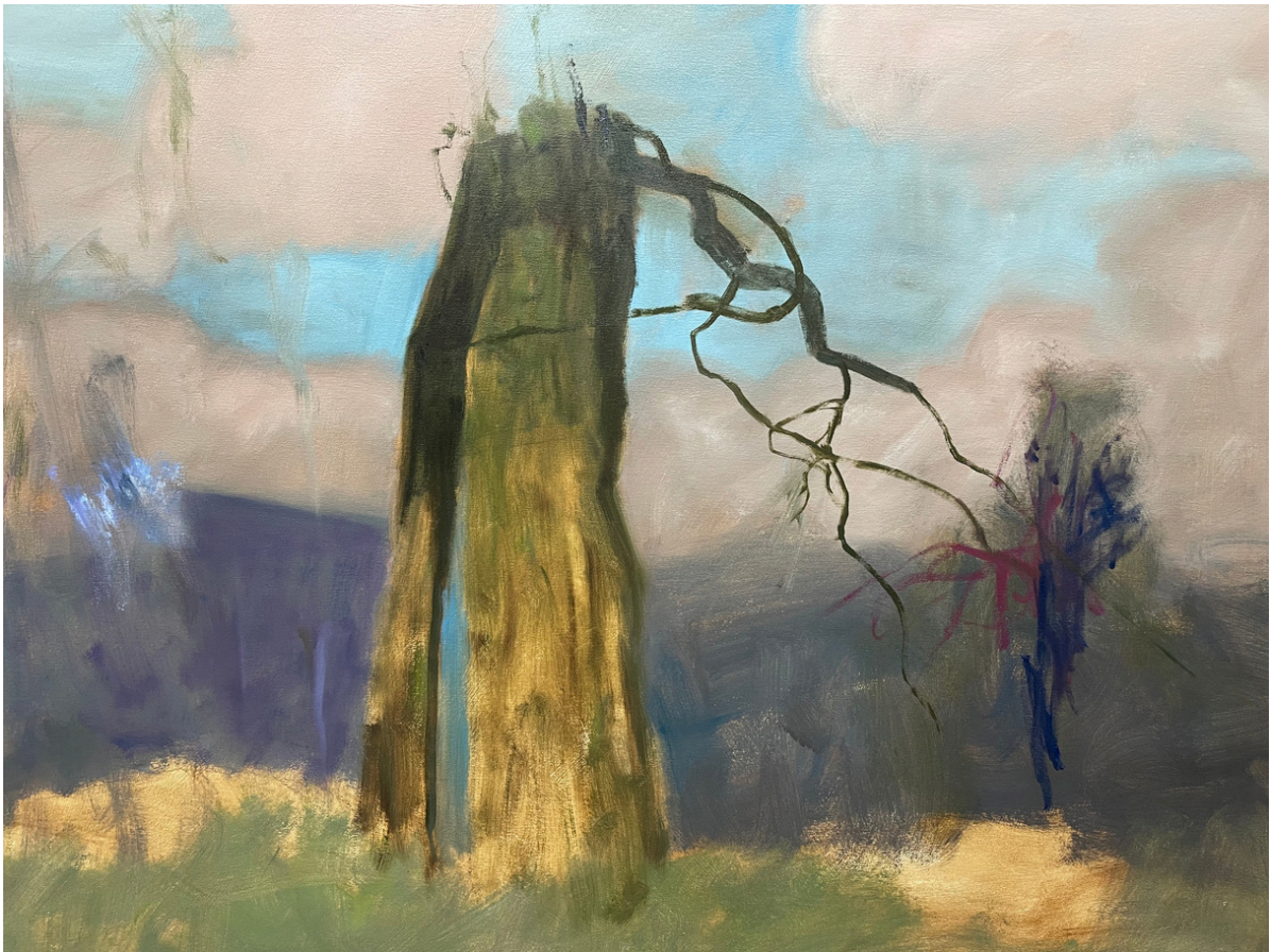
Oil on canvas, 91.4 x 122 cm, 2024