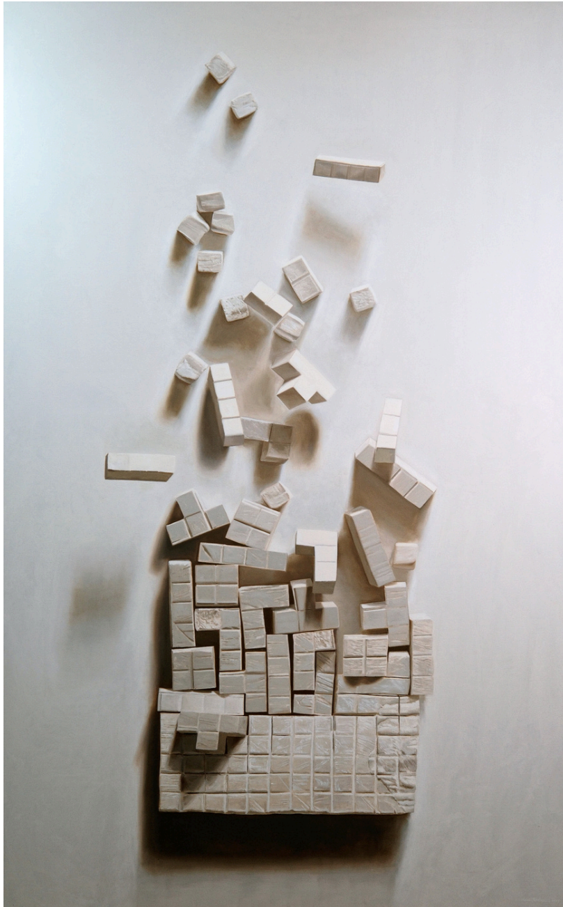
(On artist page) Oil on canvas, 244 x 152.4 cm, 2024