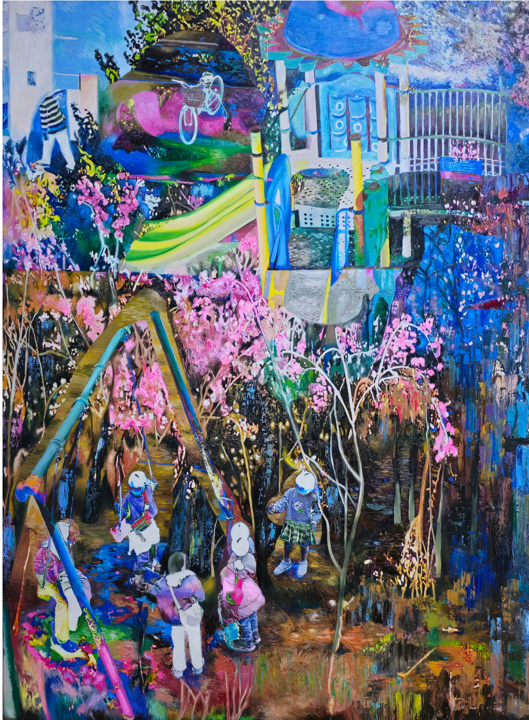
(On the cover) Oil and acrylic transfer on canvas, 130 x 97 cm, 2024