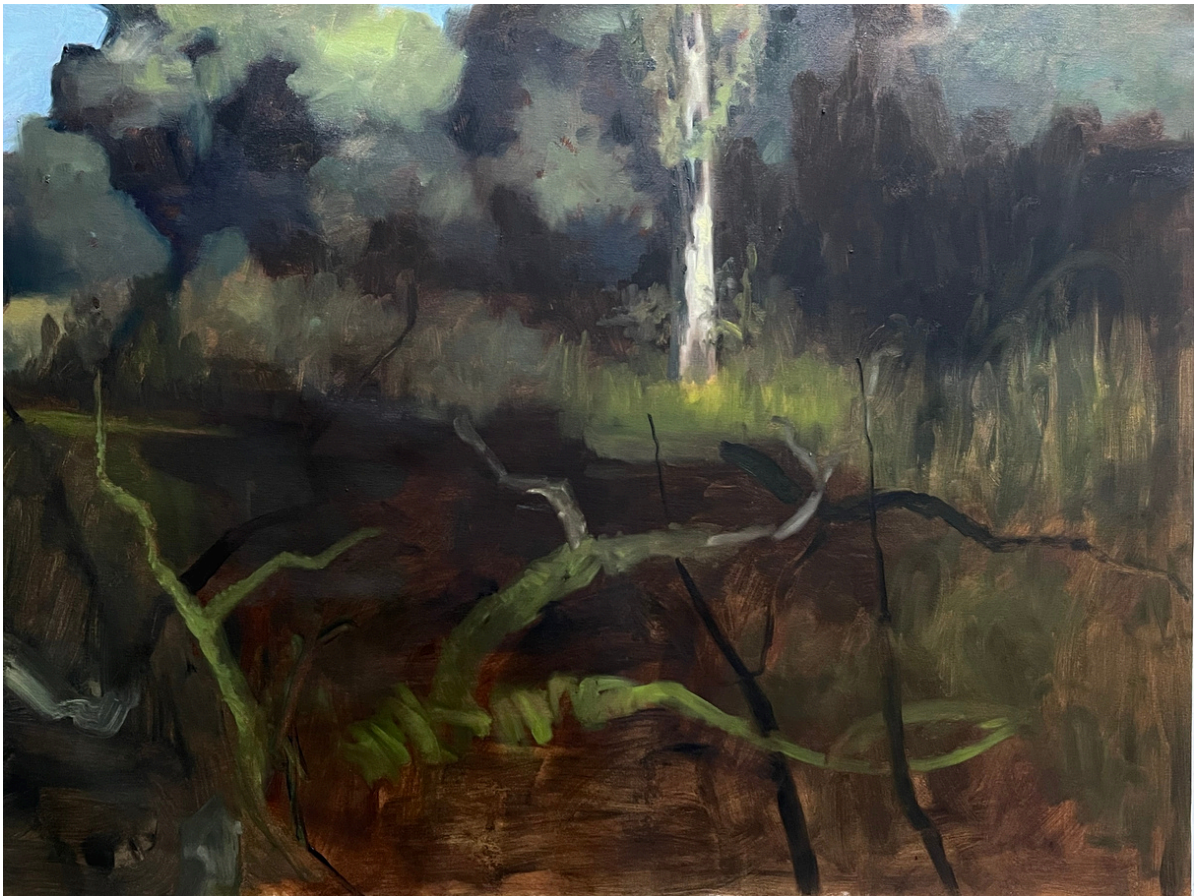
Oil on canvas, 91.4 x 123 cm, 2024