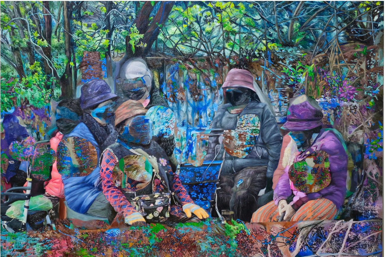
Oil and acrylic transfer on canvas, 97 x 130 cm, 2024