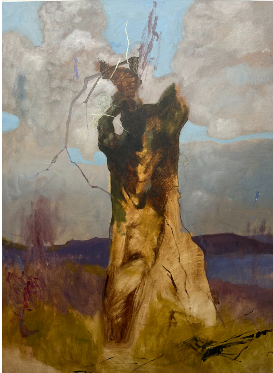
Oil on canvas, 213.4 x 152.4 cm, 2024