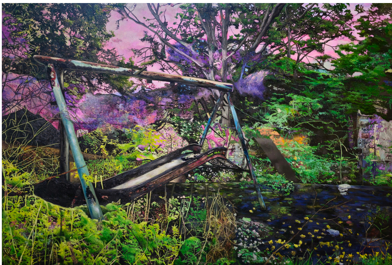
Oil and acrylic transfer on canvas, 131 x 195 cm, 2024