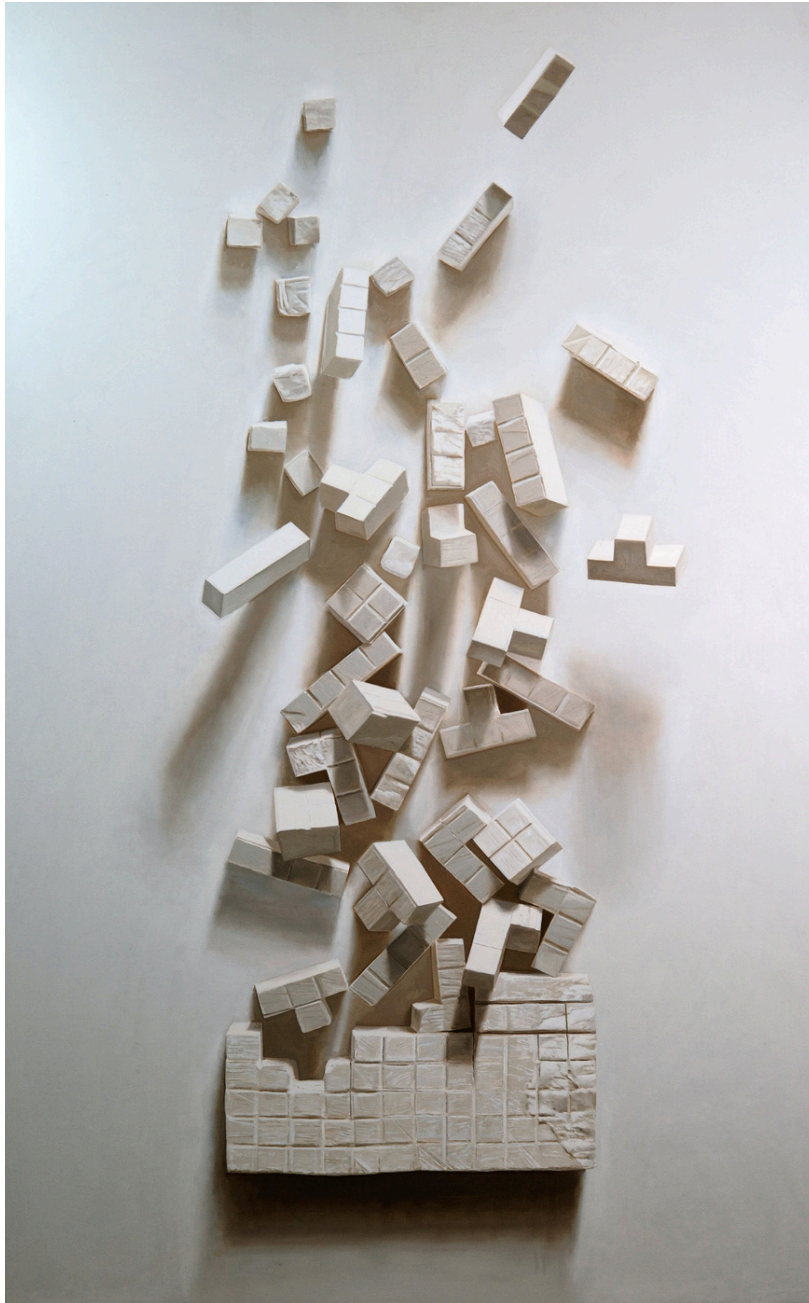
Oil on canvas, 244 x 152.4 cm, 2024