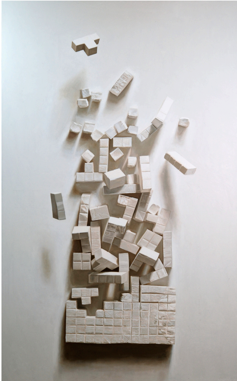
Oil on canvas, 244 x 152.4 cm, 2024