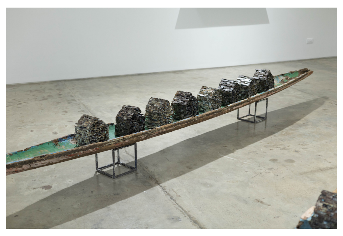
(On the cover) Found objects, wood, steel 47 x 404 x 41 cm 2024