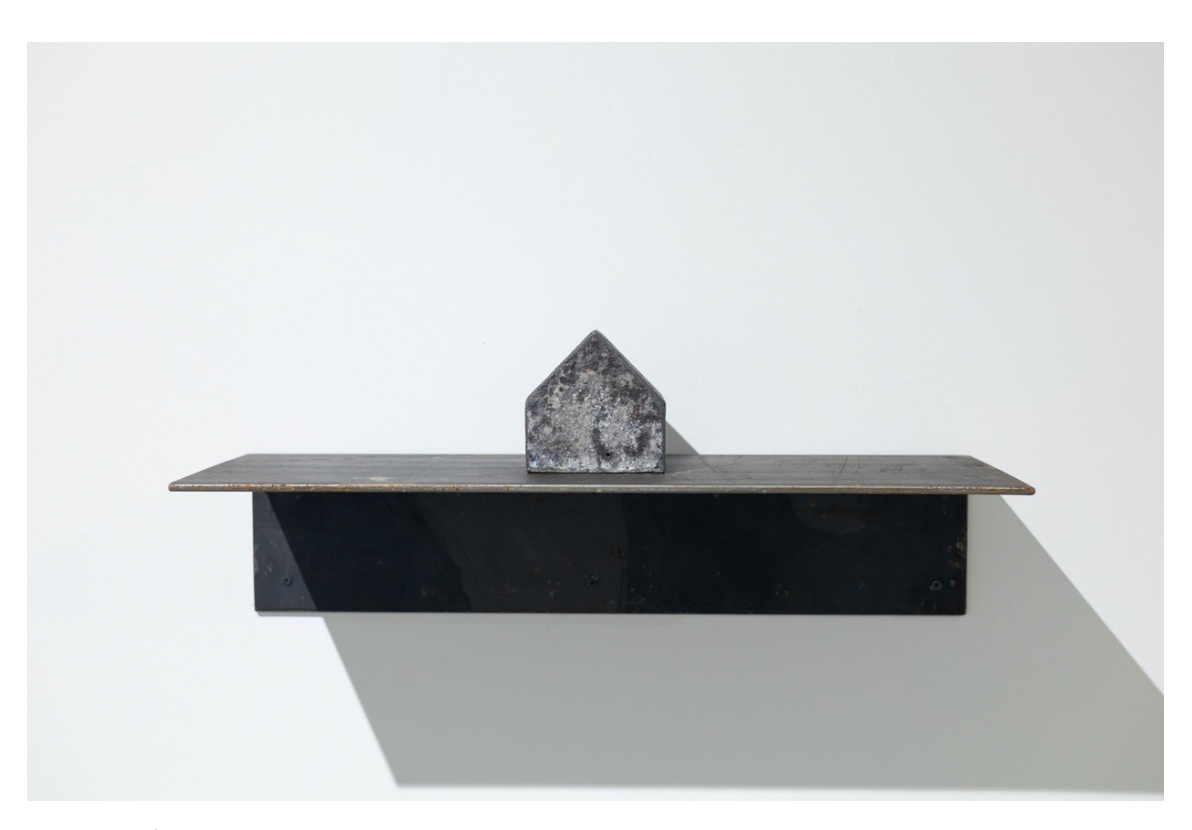
Found objects, steel 24 x 59 x 23.5 cm 2024