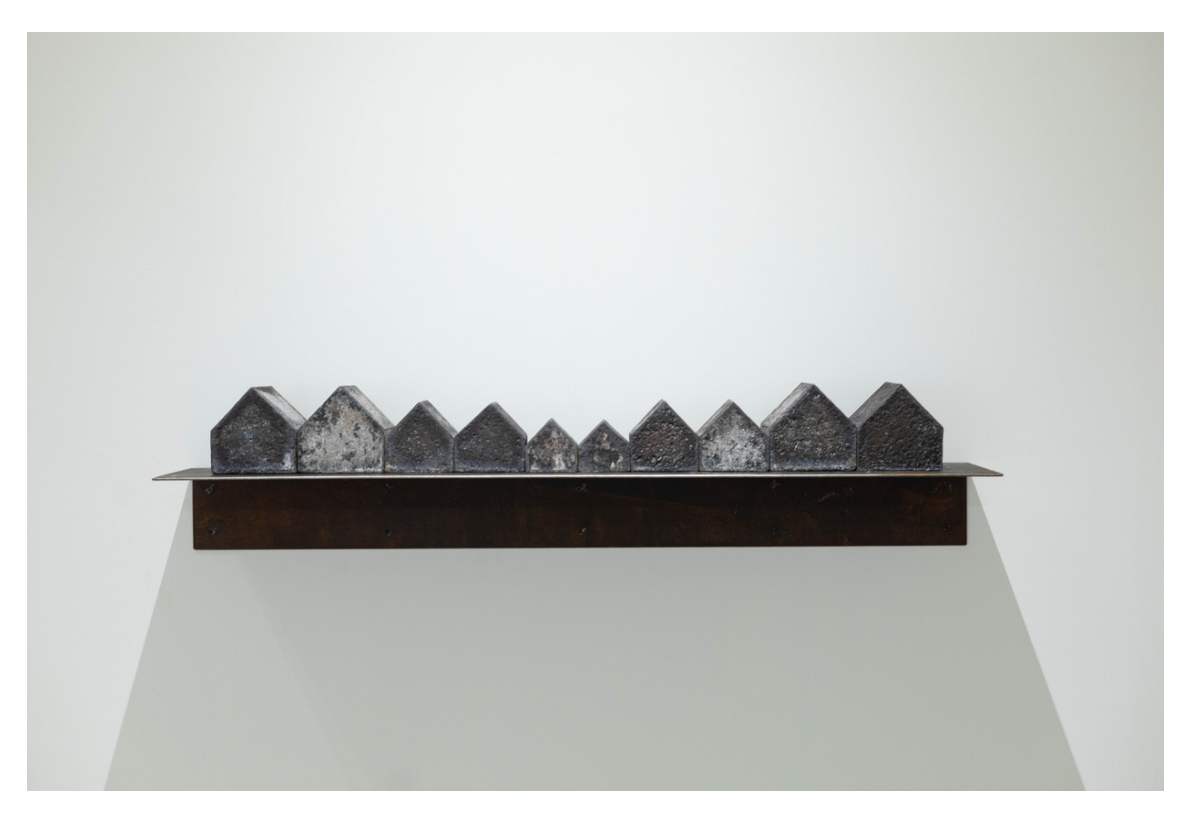
Found objects, steel 27 x 122 x 23.5 cm 2024