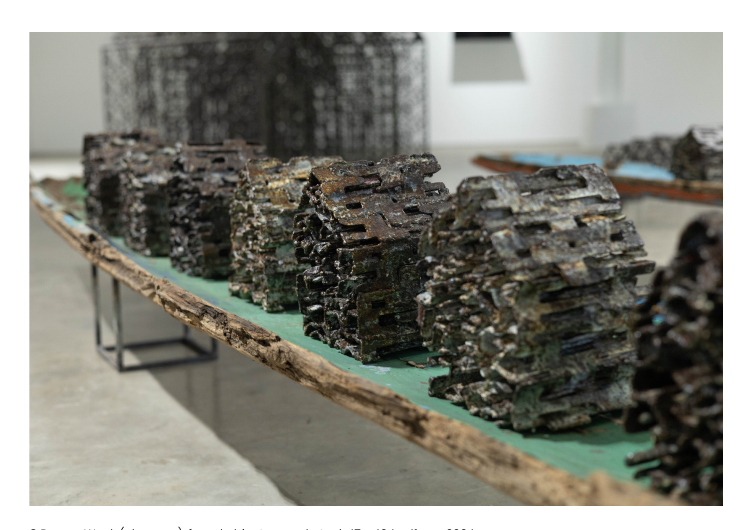
8 Days a Week (close-up), found objects, wood, steel, 47 x 404 x 41 cm, 2024.