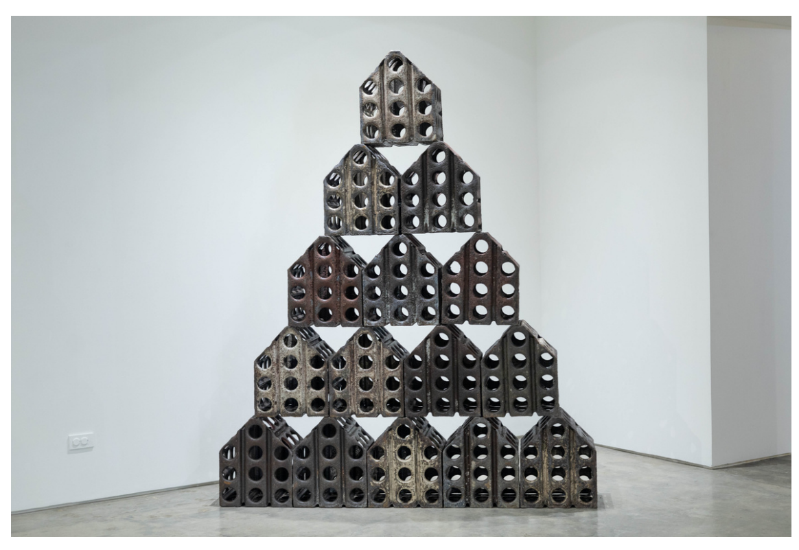
Found objects, steel Various dimensions 2024