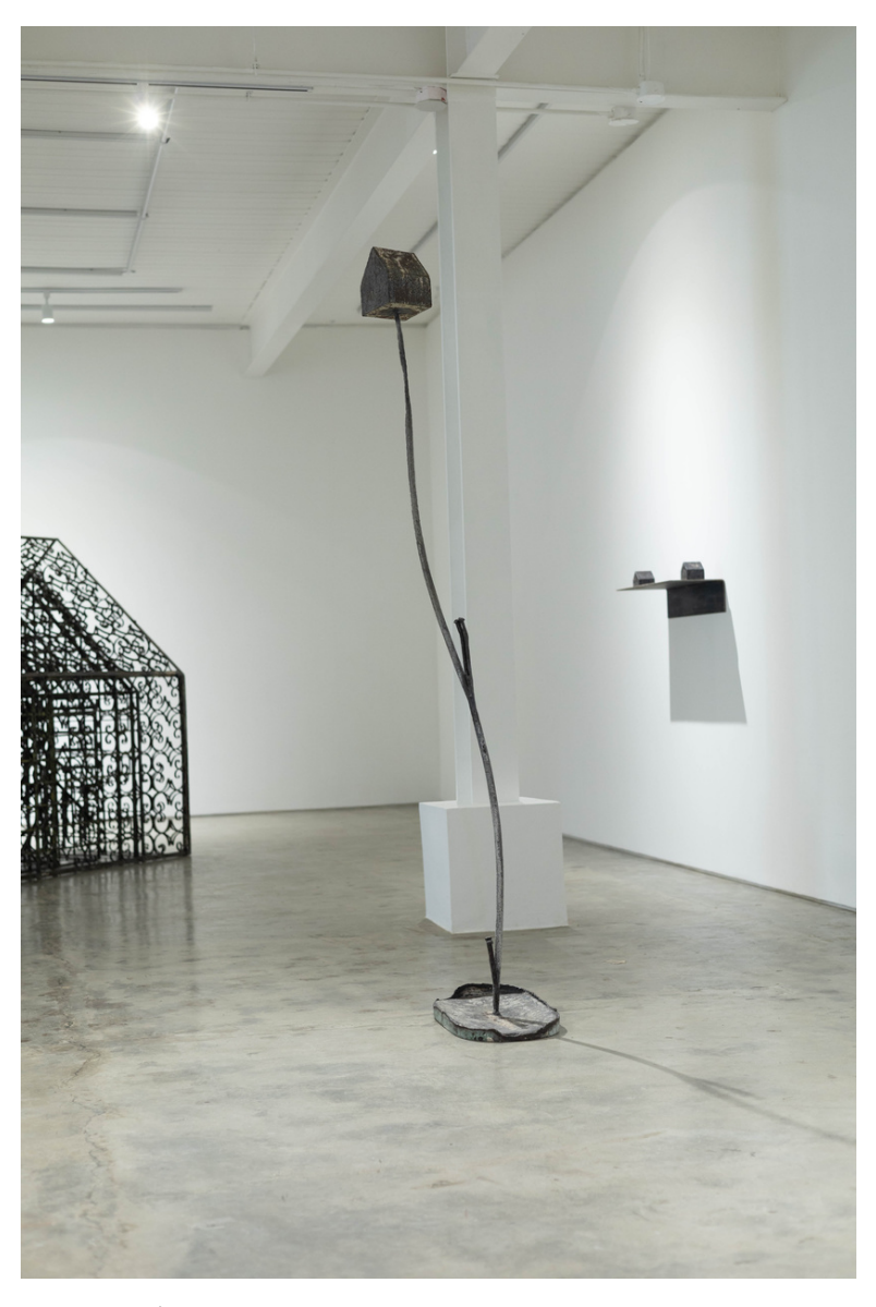
Found objects, steel 191 x 46 x 26 cm 2024