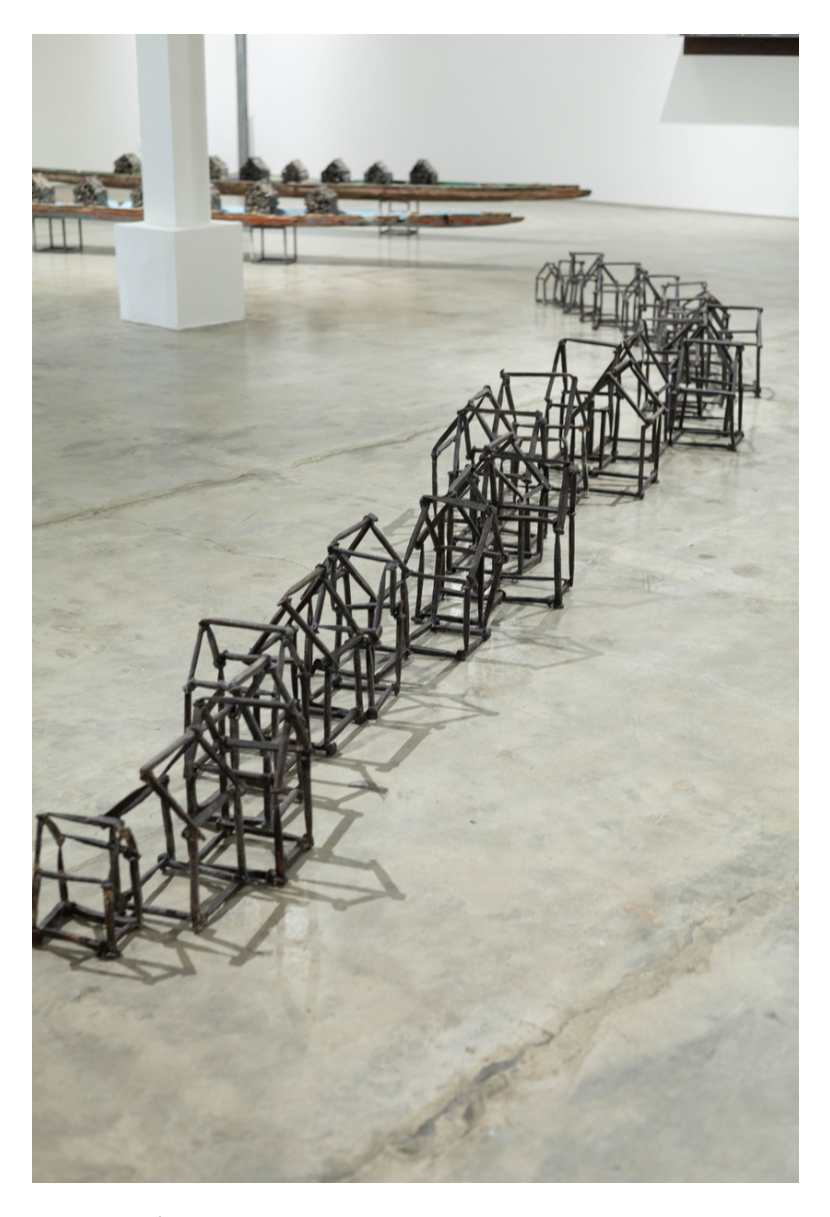
Found objects, steel Various dimensions 2024