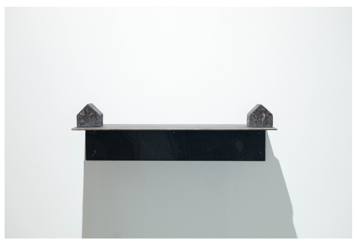
Found objects, steel 22 x 64 x 23 cm 2024