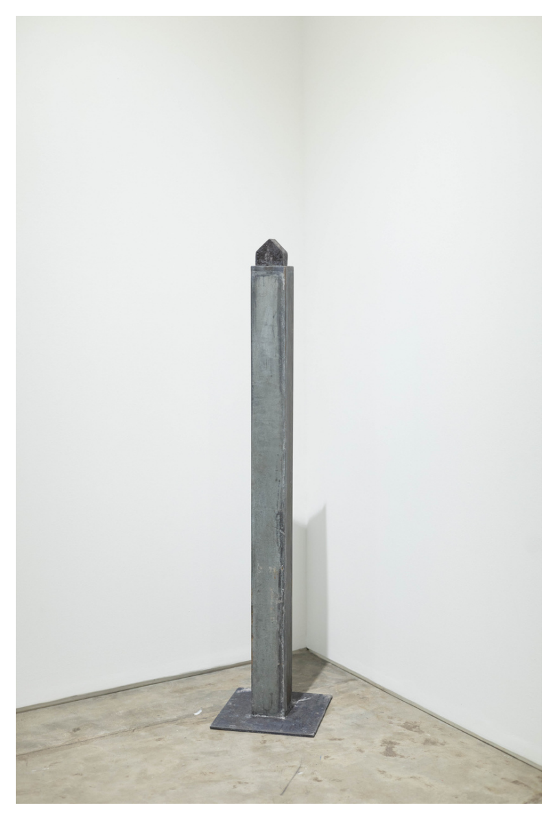
Found objects, steel 137 x 30.5 x 30.5 cm 2024