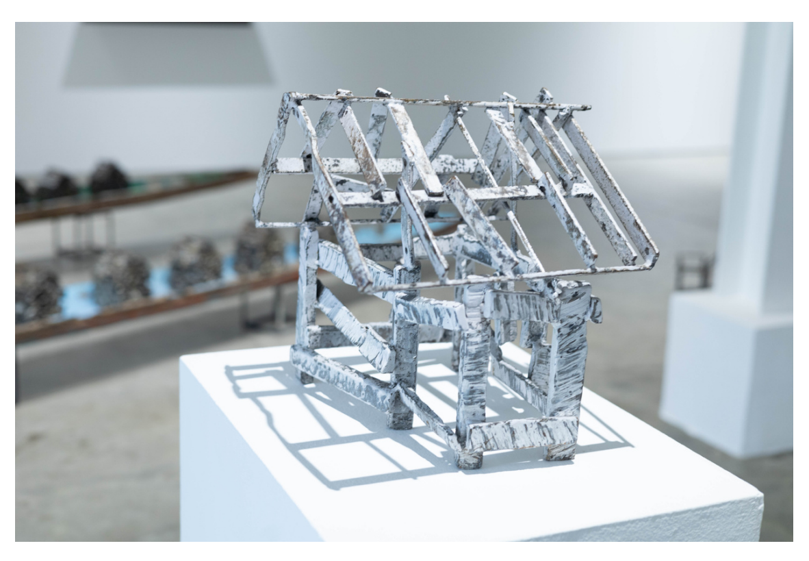
Found objects, steel 32 x 30.5 x 30.5 in 2024