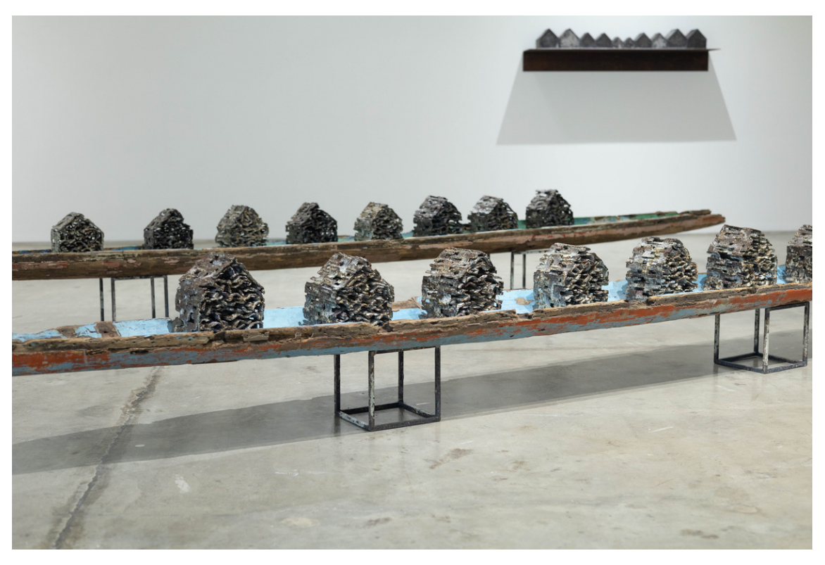
Found objects, wood, steel 48 x 404 x 38 cm 2024