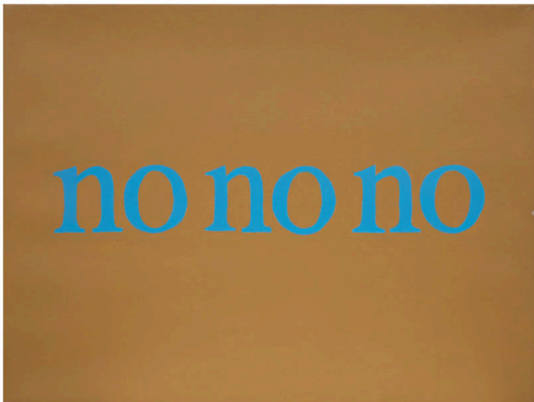
no no no Oil on canvas 30.5 x 41 cm 2000 - 2006