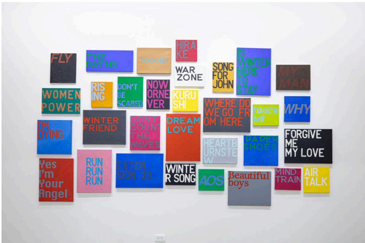
Titles of Yoko Ono's music, a series of text paintings from 2000 to 2006 by Maria Cruz