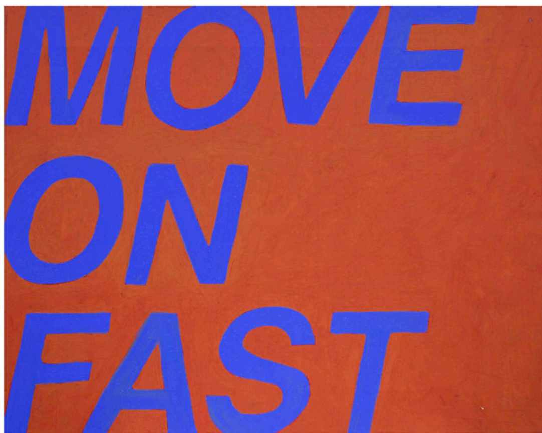
MOVE ON FAST Oil on canvas 41 x 51 cm 2000