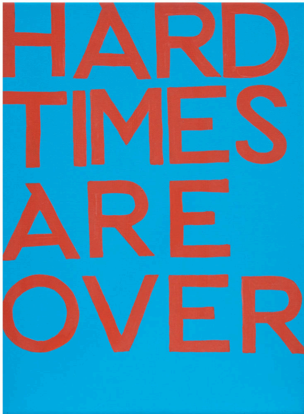
HARD TIMES ARE OVER