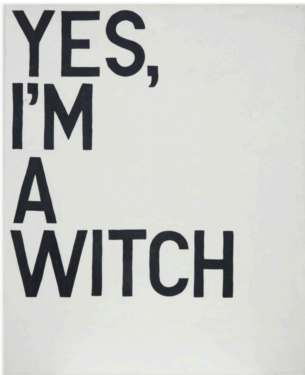
YES, I'M A WITCH Oil on canvas 56 x 46 cm 2001